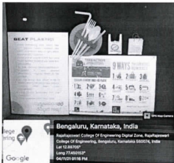
Photo.3: Information hand out on ways to beat plastic in daily life is displayed in notice board

#14, Ramohalli Cross, Kumbalagodu, Mysore Road, Bengaluru-74