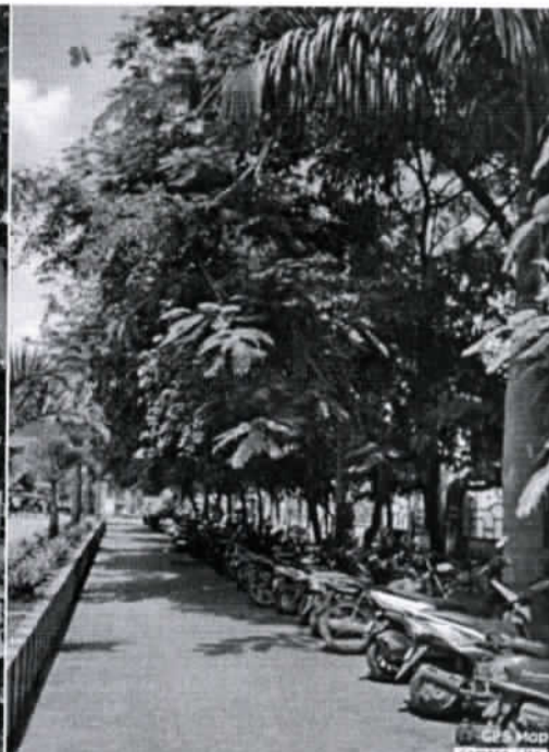
Rajarajeswari College Of Engineering College Block, Bengaluru, Karnataka 560074, India

Latitude 12.88597275° Longitude 77.44985441° Local 01:28:54 PM Altitude 678.08 meters GMT 07:58:54 AM Tuesday, 31-08-2021