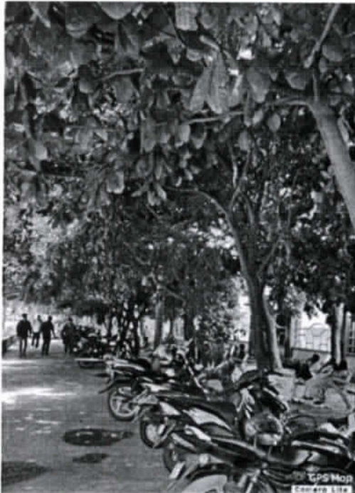
Rajarajeswari College Of Engineering Parking, Bengaluru, Karnataka 560074, India

Latitude 12.88597275° Longitude 77.44985441° Local 01:28:54 PM Altitude 678.08 meters GMT 07:58:54 AM Tuesday, 31-08-2021