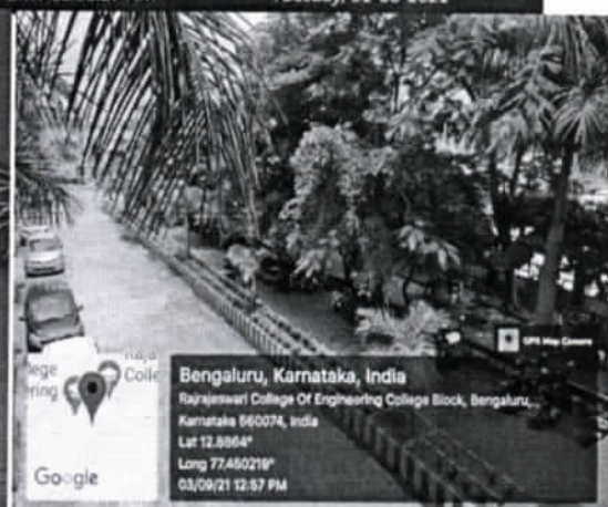
Bengaluru, Karnataka, India Rajarajeswari College Of Engineering College Block, Bengaluru, Karnataka 560074, India Lat 12.8864° Long 77.450219° 03/08/21 12:57 PM