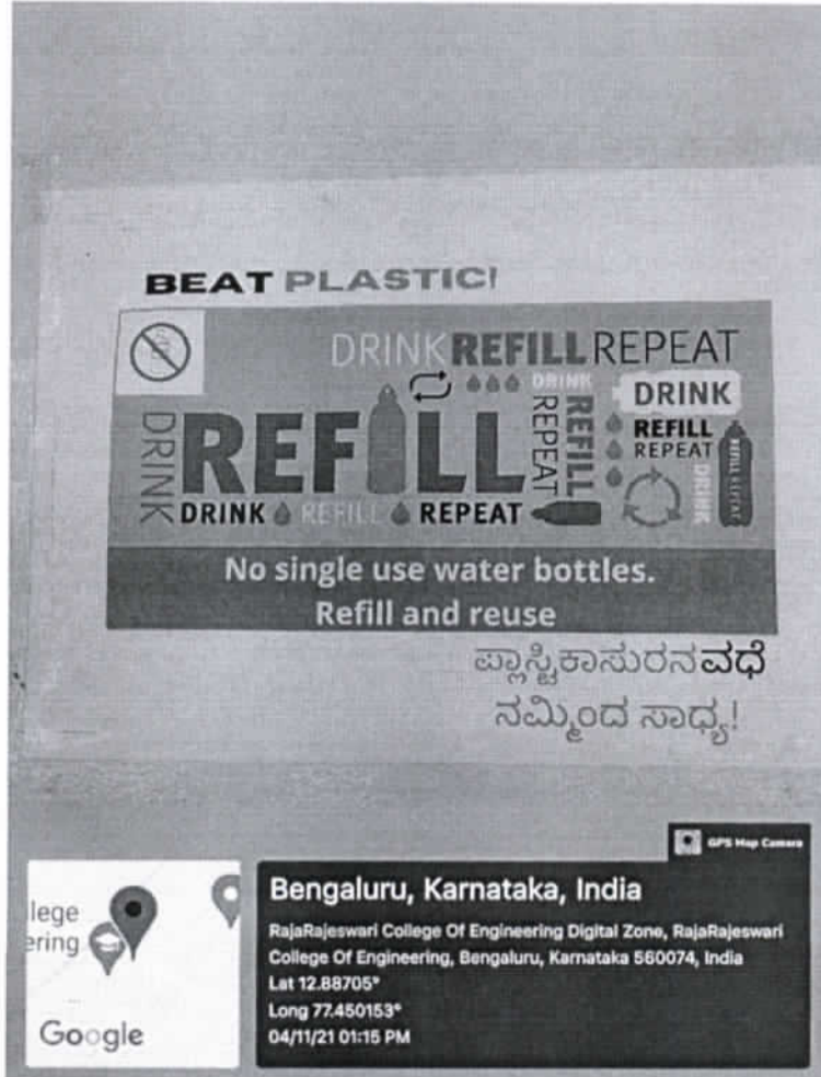
Photo.4: Information hand out on recycling of plastic in daily life is displayed in notice boards

Single-use plastic items such as plastic bottles, bags, spoons, straws and cups are banned completely and awareness is created among staff and students through orientation and display boards in the premises (Photo.3 and Photo.4). To restrict the use of plastic, measures have been taken to replace plastic tea cups and glasses with steel glasses in the canteen. The staff and students are informed to use steel or copper water bottles instead of plastic bottles. The institution also conducted activities on the Ban on use of plastics and created awareness to the faculties the localities in and around the campus. Measures have been taken to create awareness to students and staff not to use plastic materials inside the college campus by issuing circulars.