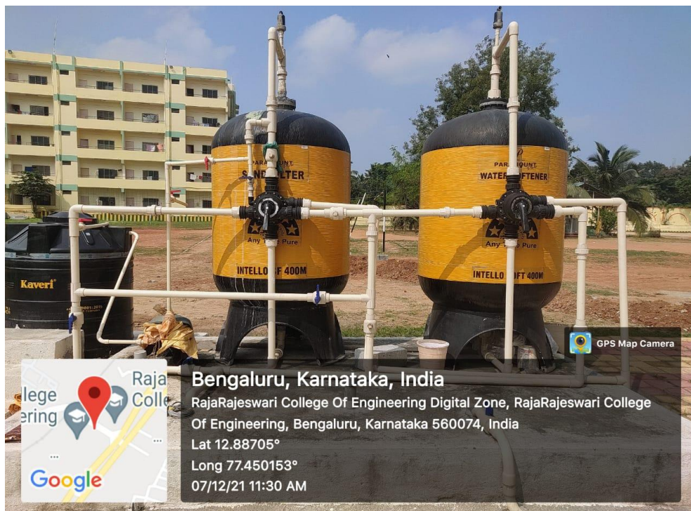
Photo.6: Water filter and Water softener plant installed in the campus