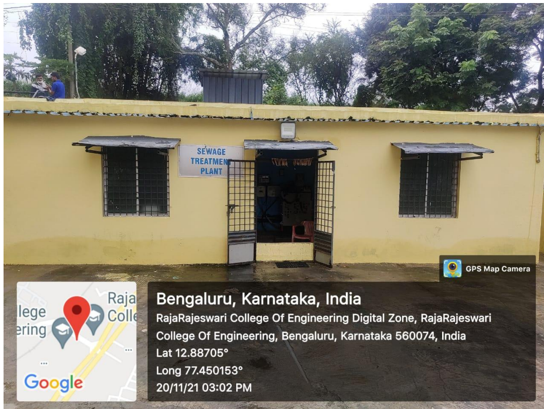
Photo.5: Centralized Sewage treatment plant at RajaRajeswari Dental College and Hospital (RRDCH)

In order to treat the domestic and other waste waters, the sewage treatment plants have been installed and successfully operated in the premises of RajaRajeswari Dental College and Hospital a sister concern organization and is located at a lower level adjacent this college. The STP capacities are 300 KLD respectively to handle the waste waters generated from College building, Hostels, Canteens and recreational areas such as gymnasium etc. The waste water is first disinfected using bleaching disinfectants and then discharged into the under drainage system leading to STP. The sewage generated from other buildings is directly discharged into the STP and is treated along with other waste waters. The STPs have been performing smoothly and deliver effluents with BOD values below 10 mg/l. The aerobic treatment followed by disinfection results in microbe concentration below 100 units as stipulated in the consent. Likewise all other listed parameters are also complied with. Monthly analysis reports are regularly forwarded to the KSPCB.