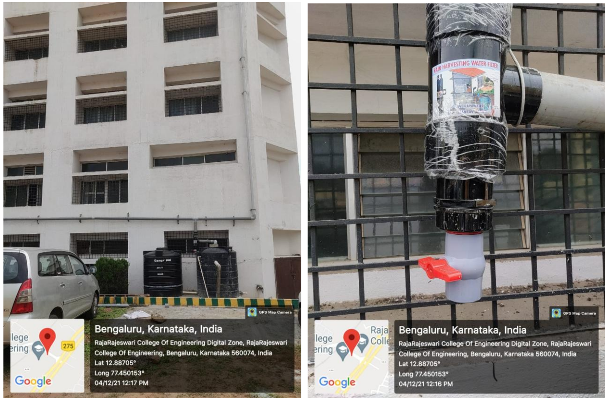
Photo.2: Rain water storage tanks and rain harvesting water filter

Criterion: 7.1.4 Academic Year: 2021-2022