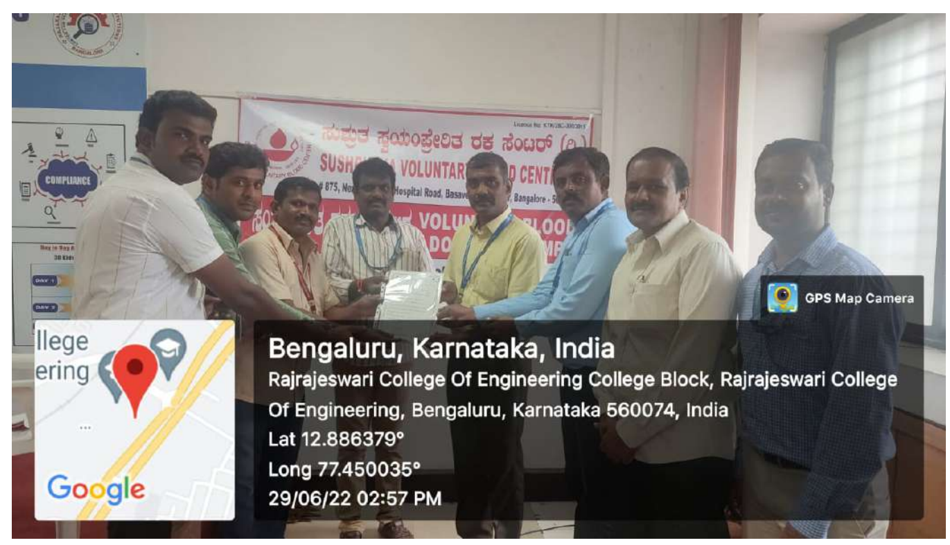
Fig.5: Appreciation certificate received from Sushrutha blood donation camp