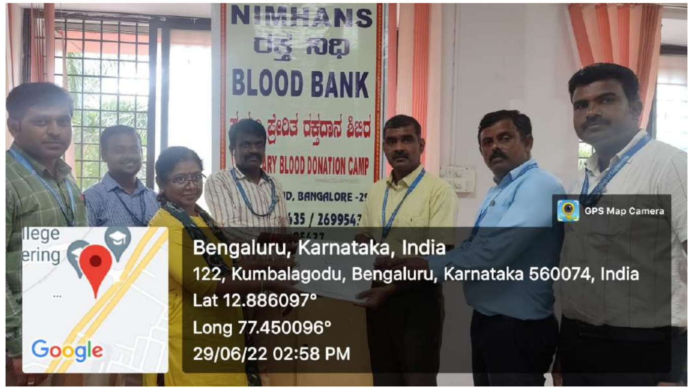
Fig.6: Appreciation certificate received from Nimhans blood donation camp