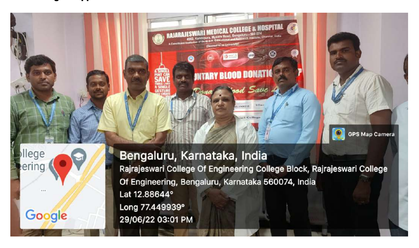
Fig.8: Appreciation certificate received from RajaRajeswari Medical College & Hospital