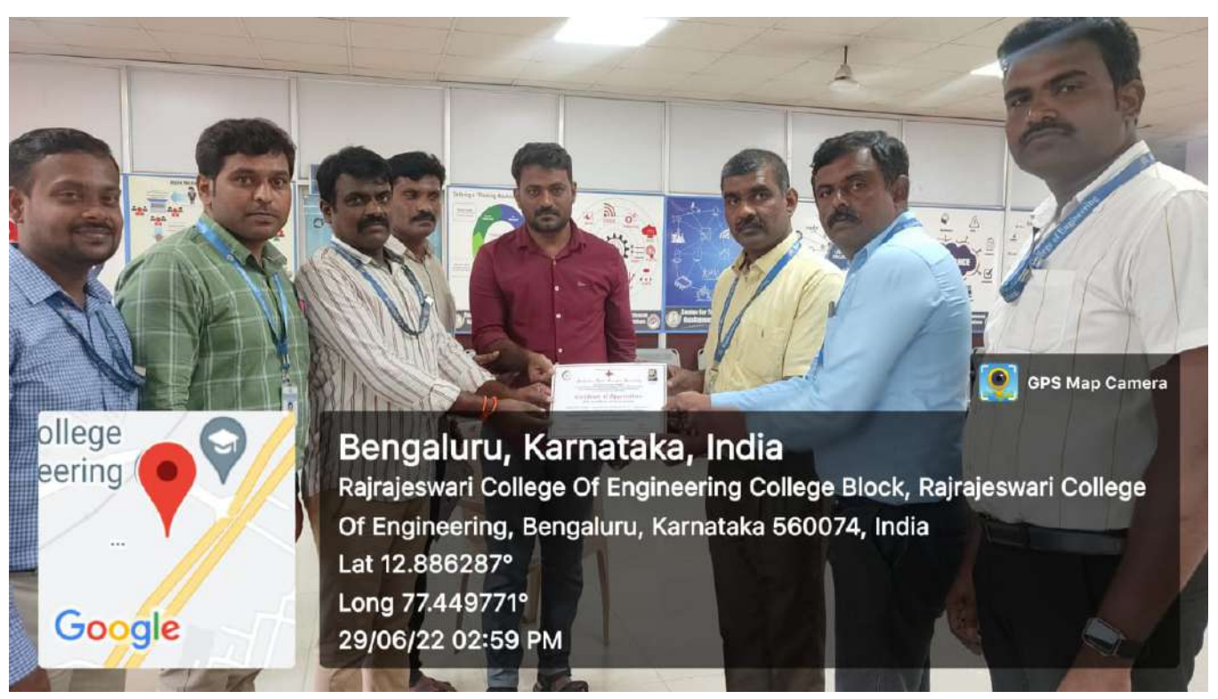
Fig.7: Appreciation certificate received from Red Cross unit