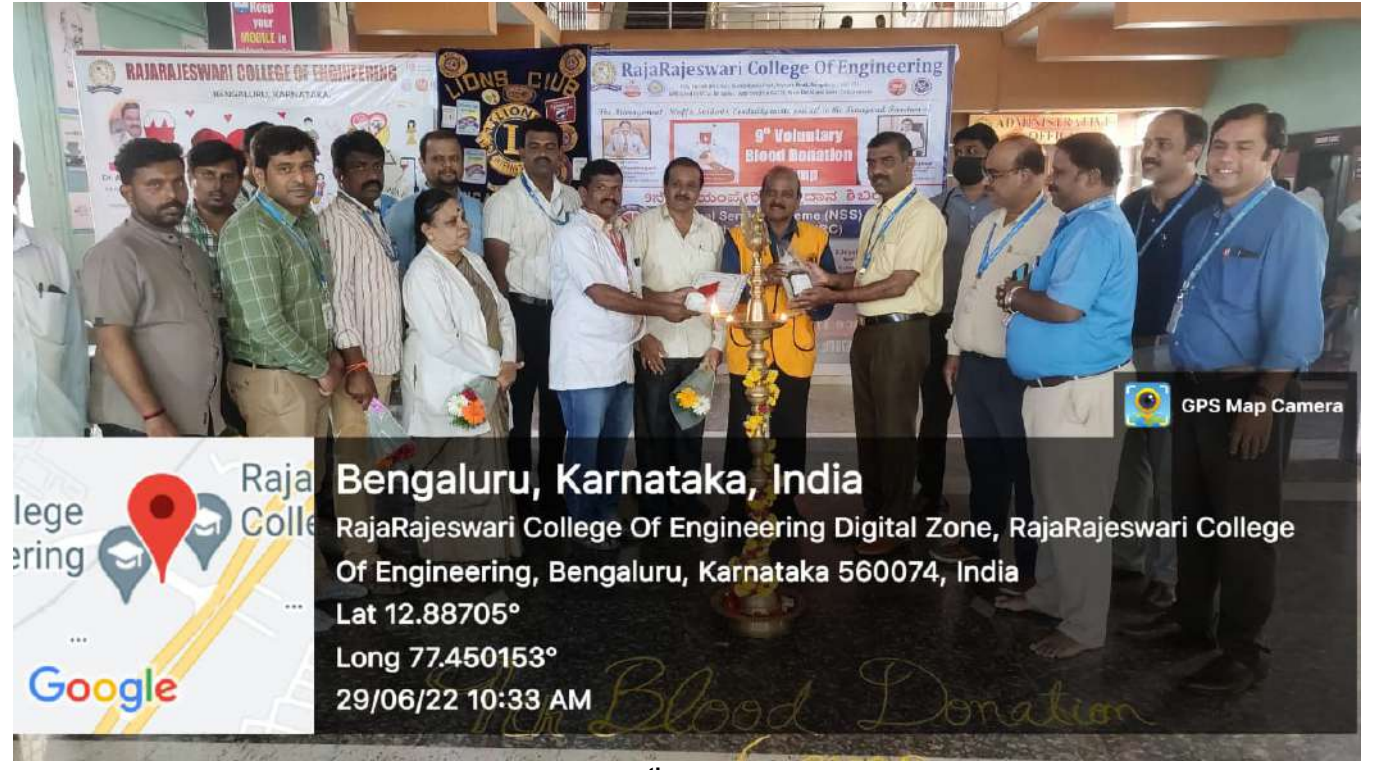
Fig.1: Inaugural Function for 9th Voluntary Blood donation camp