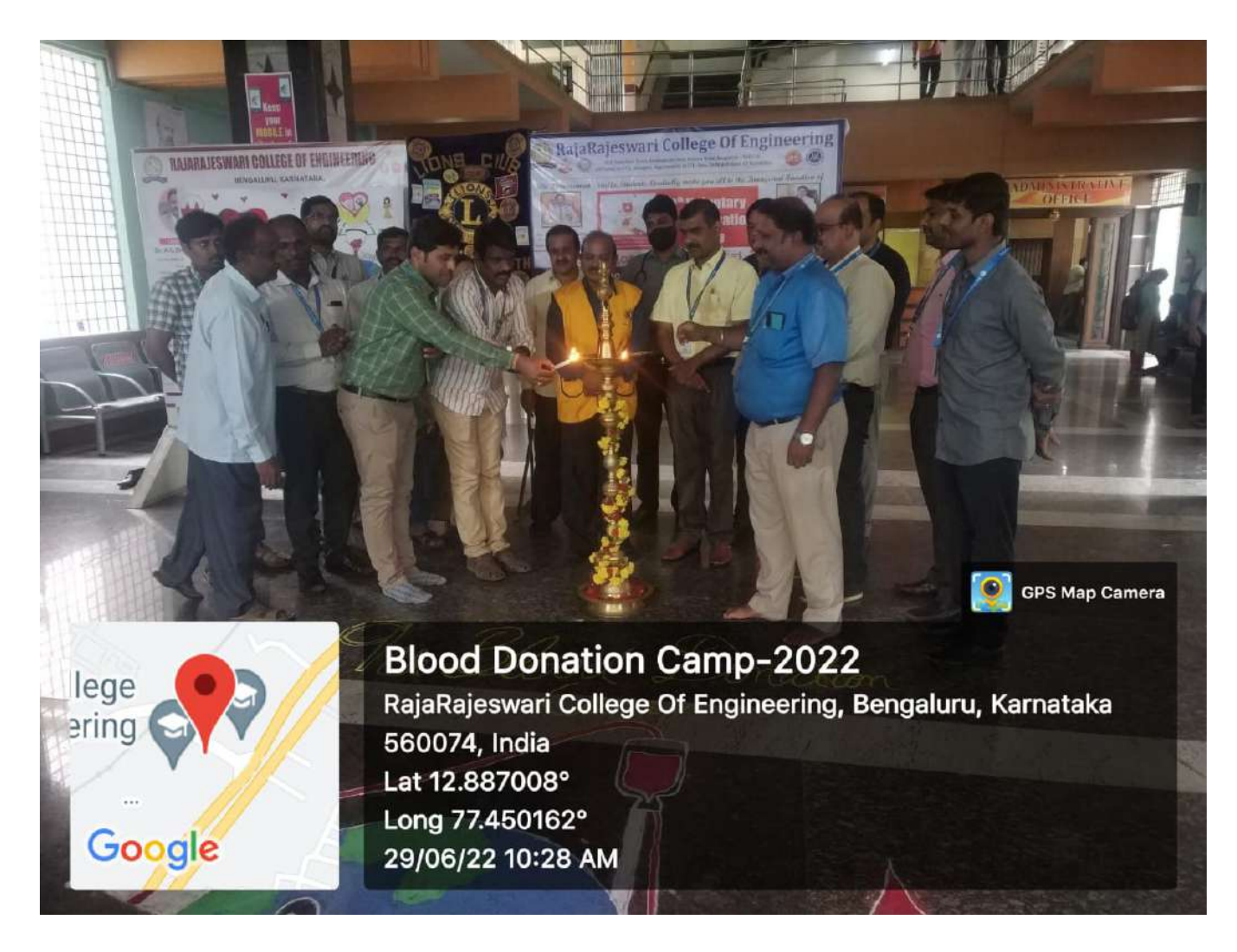
Fig.2: Lighting the lamp for 9th Voluntary Blood donation camp