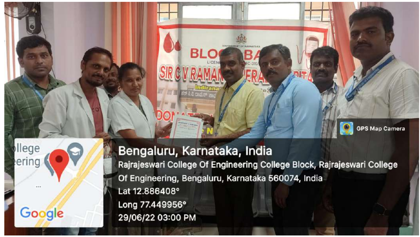
Fig.7: Appreciation certificate received from SIR C V RAMAN Blood bank