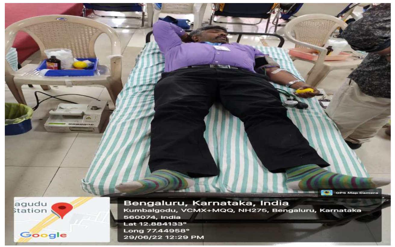
Fig.4: Faculties donated blood