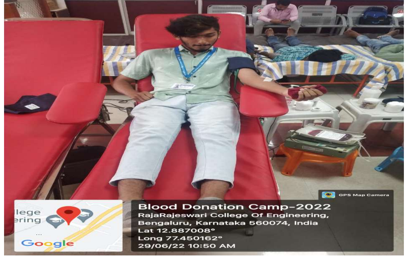
Fig.3: Students donated blood