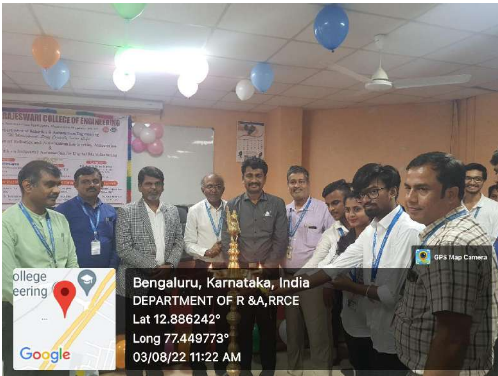
Faculty members with Chief Guest and Principal