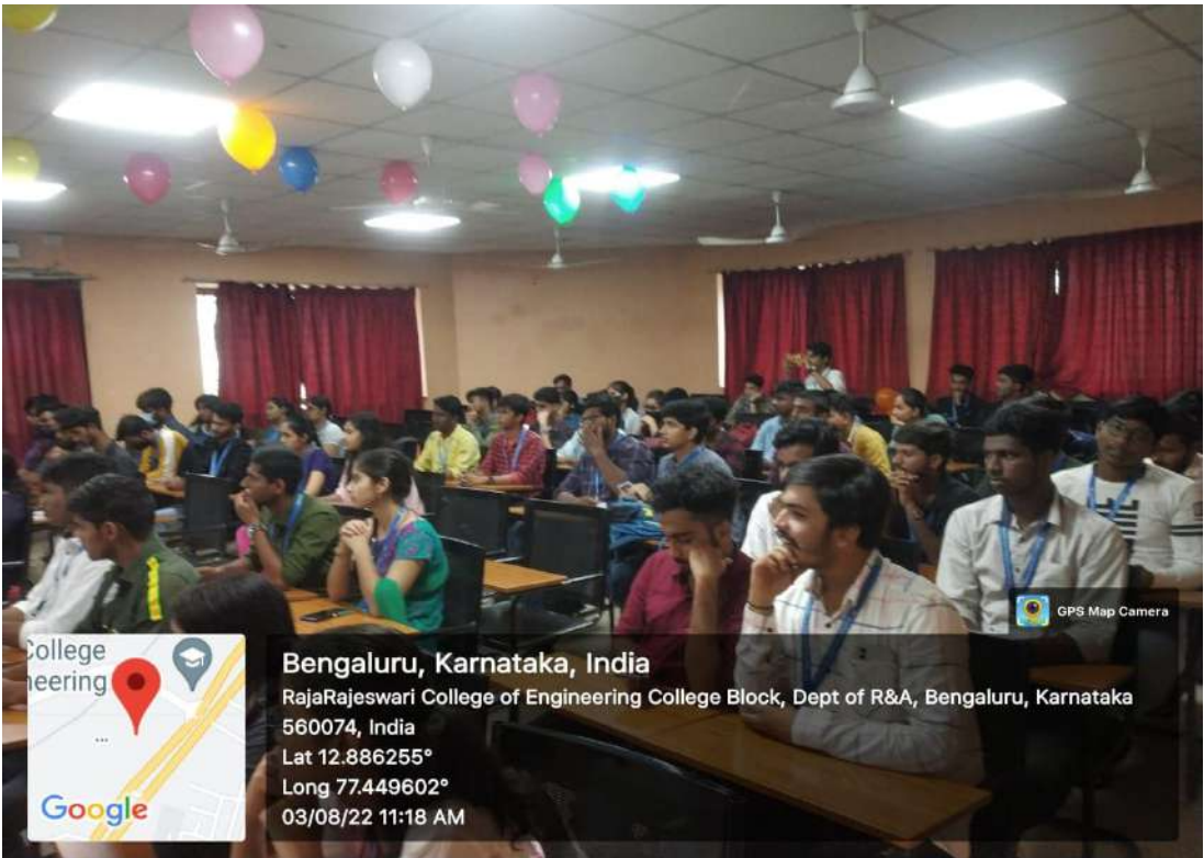
Department of Robotics and Automation Engineering association members for the AY 20 21 with the dignitaries

Bengaluru, Karnataka, India DEPARTMENT OF R & A, RRCE Lat 12.886242° Long 77.449773° 03/08/22 11:53 AM