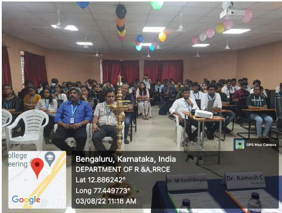
Faculty and students during the Inauguration of the Department of Robotics and Automation Engineering associations