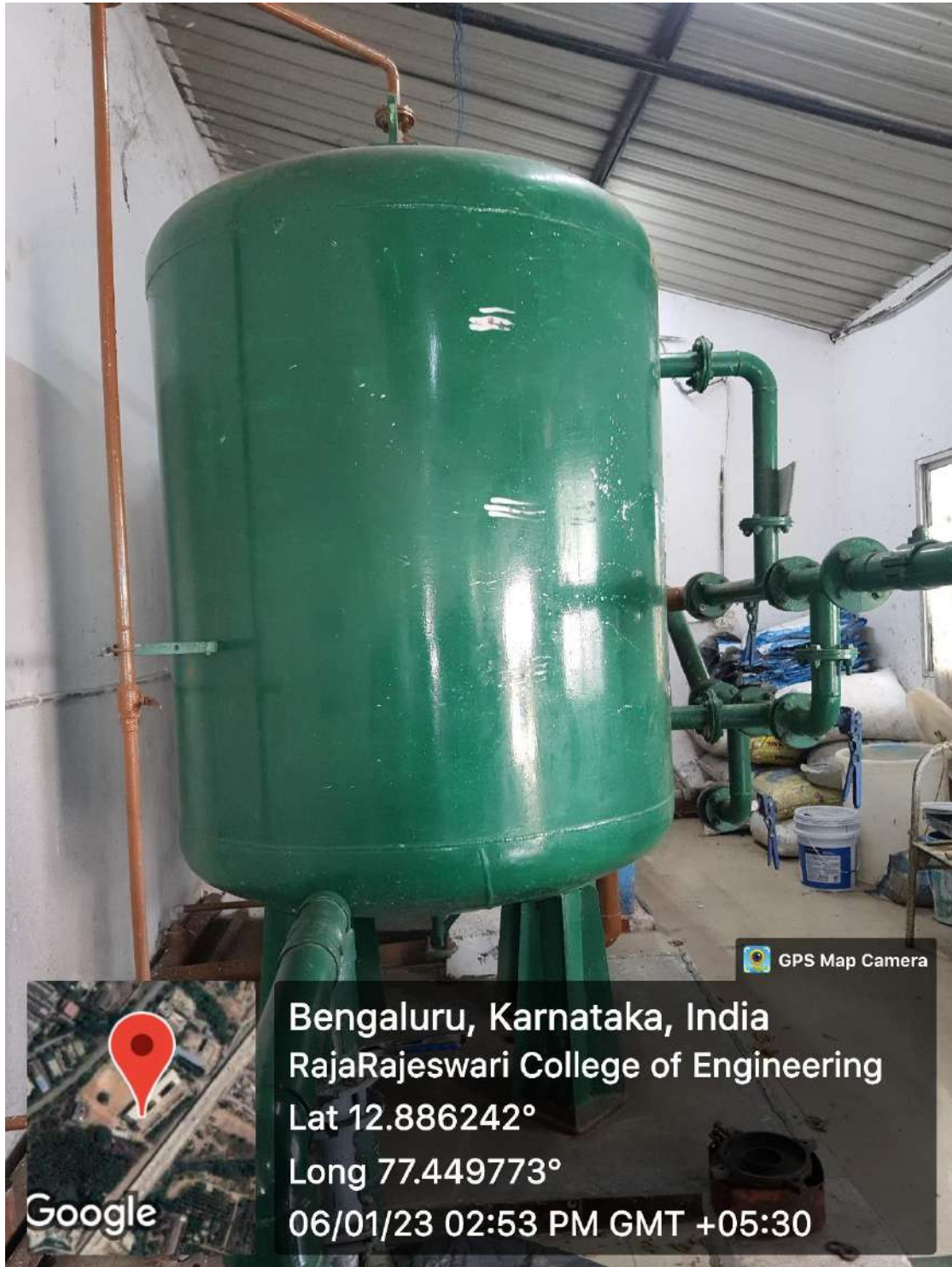
Sewage Treatment Plant facility at RRMCH

Campus: #14, Ramohalli Cross, Kumbalgodu, Mysore Road, Bengaluru – 560074