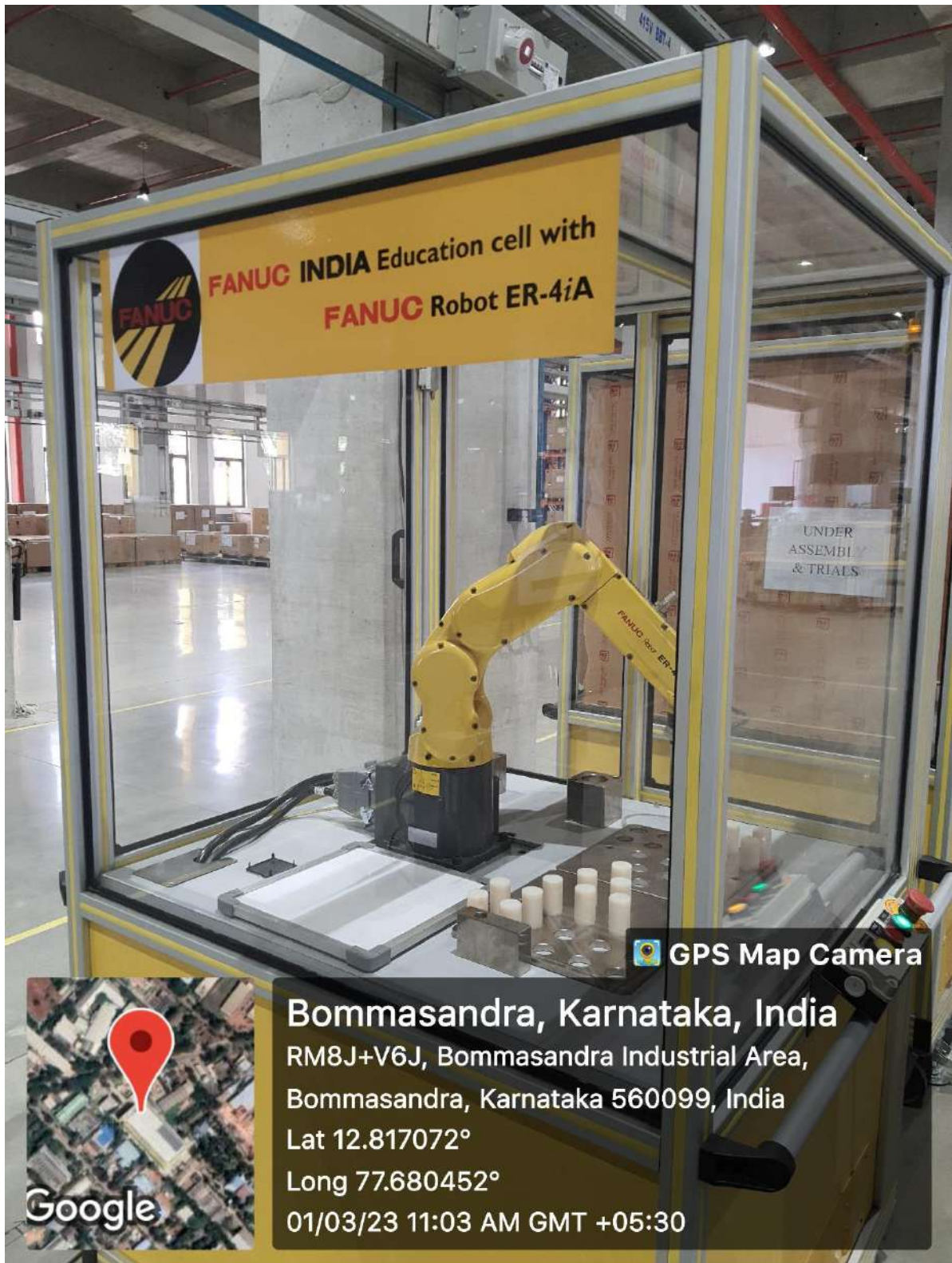
FANUC ROBOT for Educational purpose