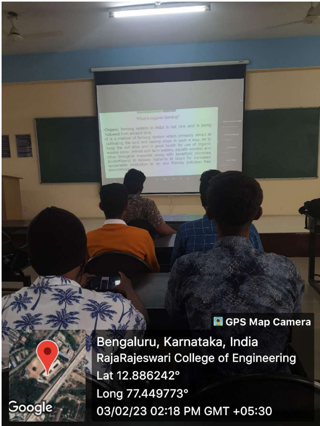
Students attending the Webinar on Organic Farming and Waste Management