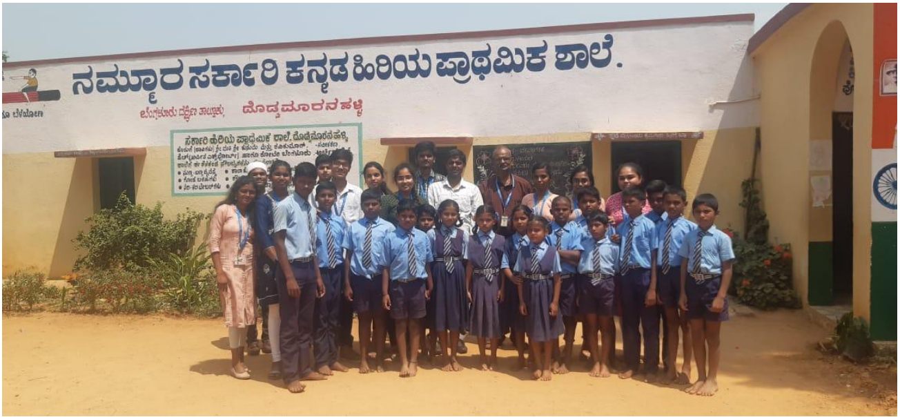
Photo with Staff, AI & ML student and Govt. primary school students