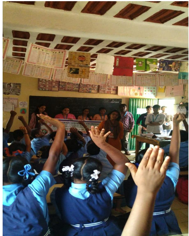
Govt. primary school students participation in events