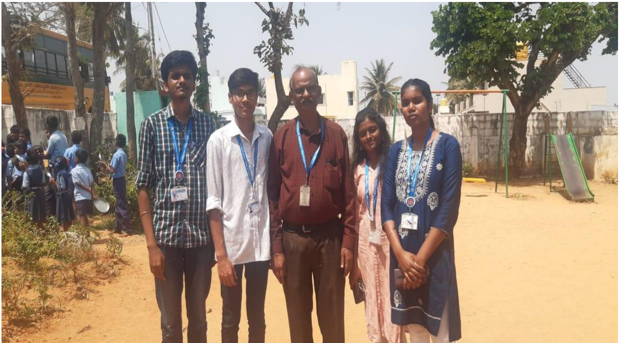
Photo with AI & ML student