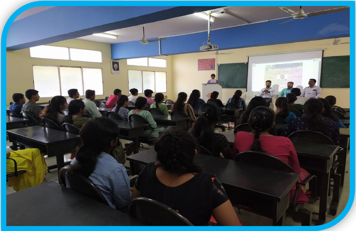
Students and faculty members are attending the Innovation Day celebrations on 18.10.2023