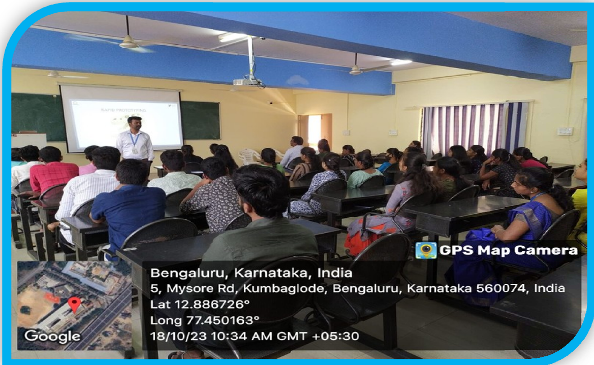
Photographs of the Innovation day 2023 Celebrations