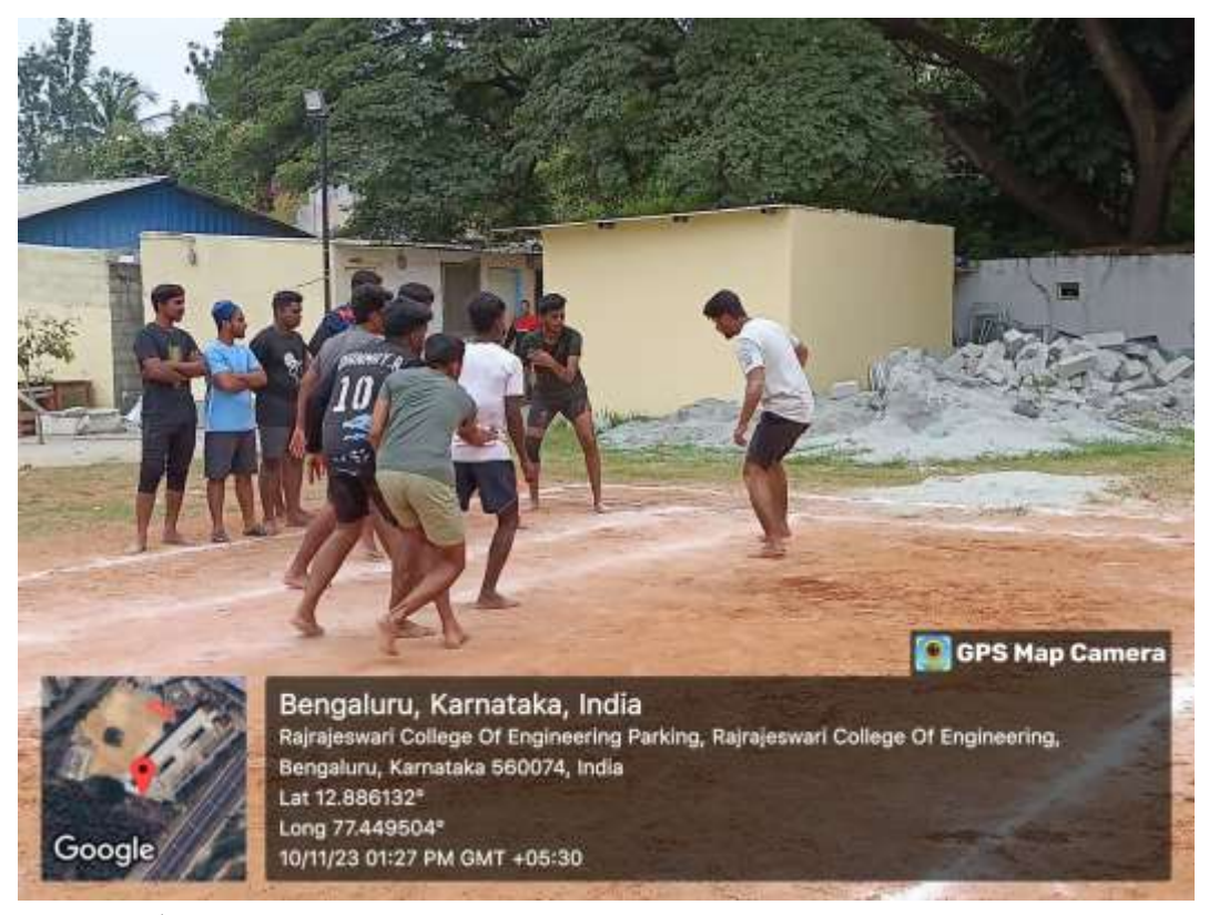
1st Year students of Robotics and Automation playing Kabaddi