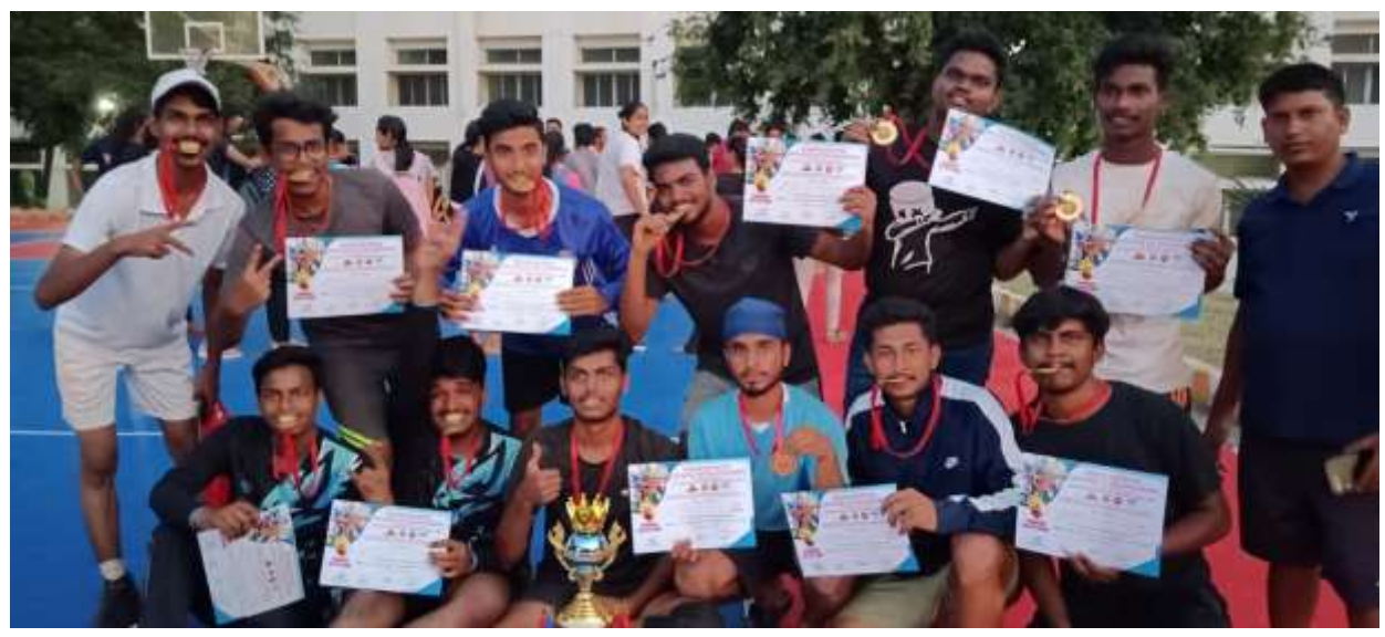
1<sup>st</sup> Year students of Robotics and Automation winning the Kabaddi and express their happiness