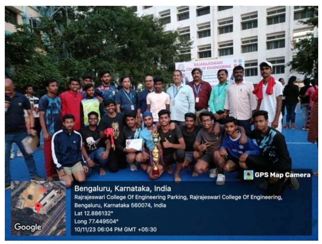
1st Year students of Robotics and Automation winning the Kabaddi and express their happiness along with the Principal, Vice Principal and HOD's

Phone: +91-80-28437124 / 28437375 Email Id: hodra@rrce.org https://www.rrce.org