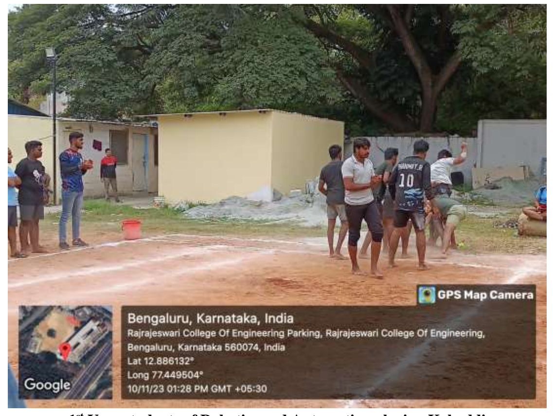
1st Year students of Robotics and Automation playing Kabaddi

Phone: +91-80-28437124 / 28437375 Email Id: hodra@rrce.org https://www.rrce.org