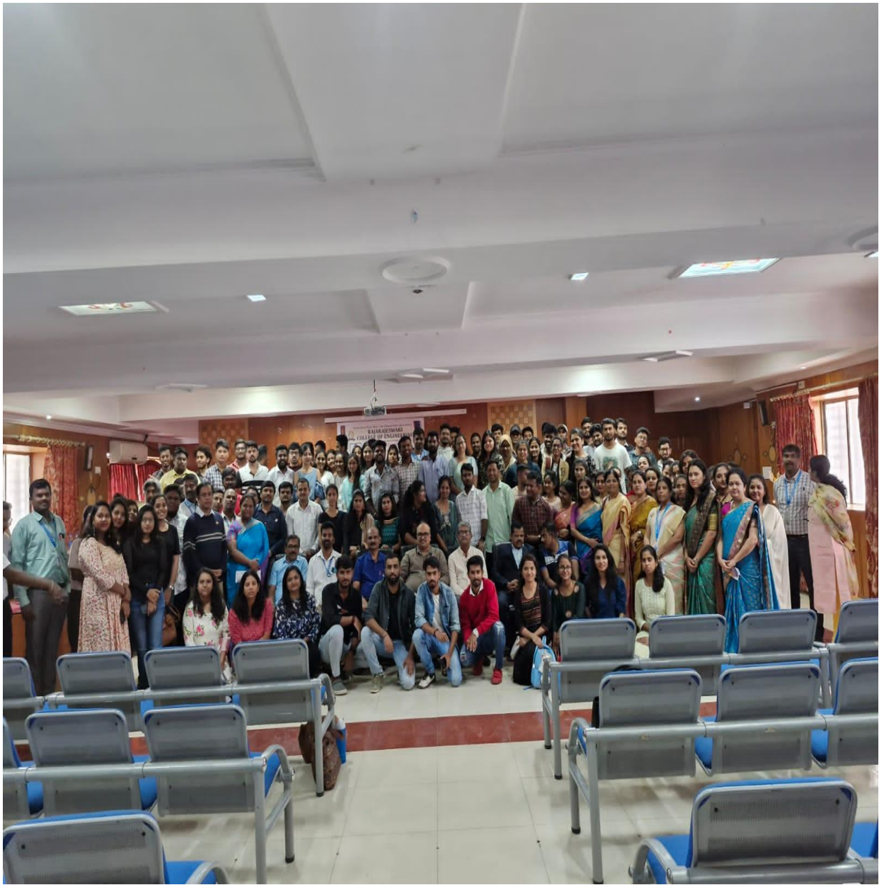
Group photo of overall Guest and all the Alumni coordinators