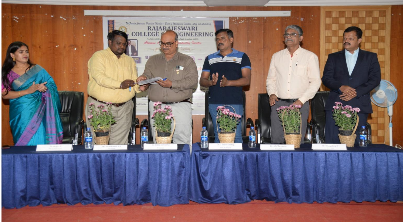
The picture of News Letter Release by the Chief Guest and Principal.