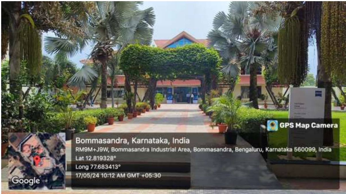
Figure 3 Carl Zeiss plant main entrance building