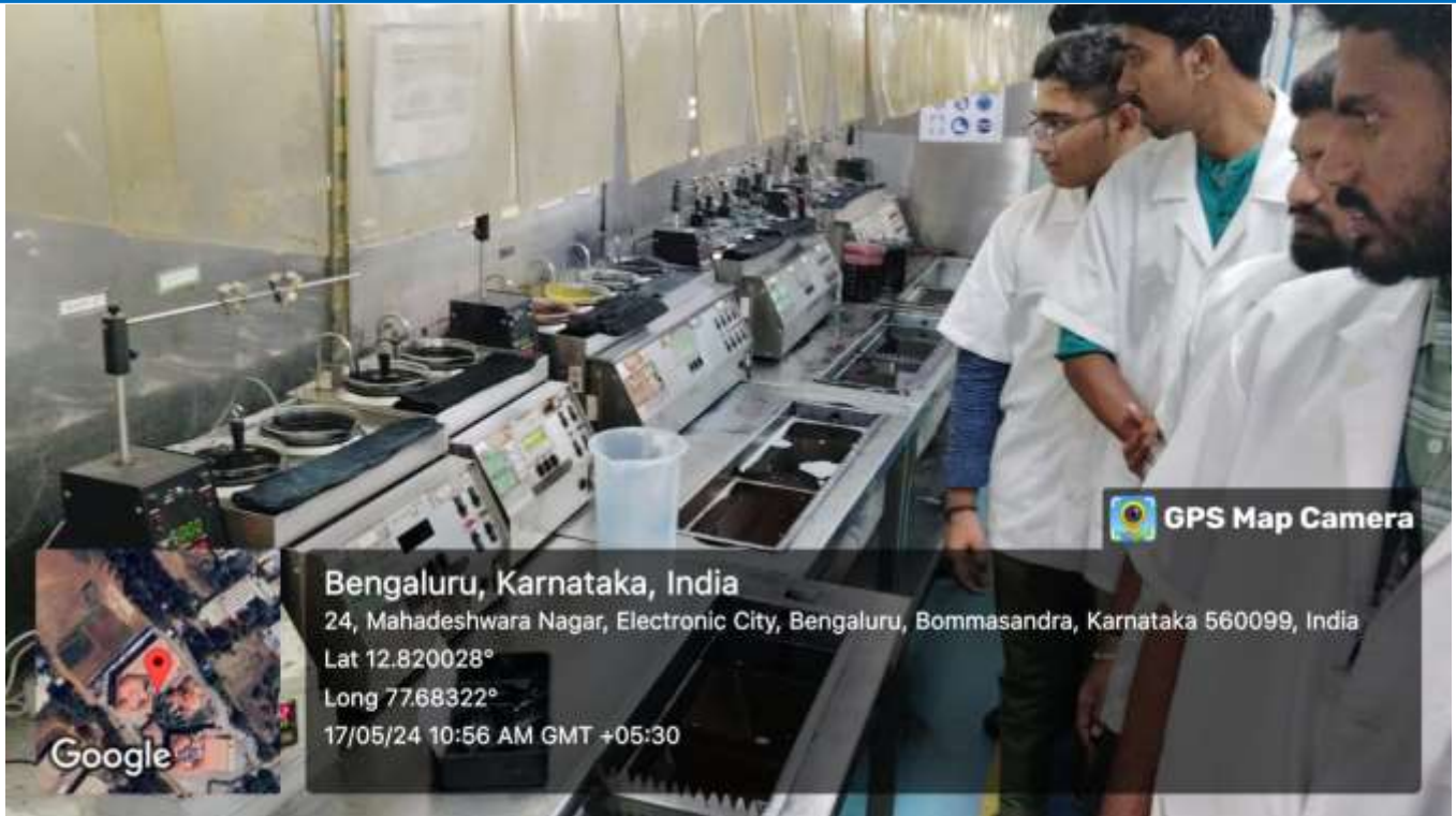
Figure 7 Students observe the lens in the bath and agitate it slowly during the coloration process