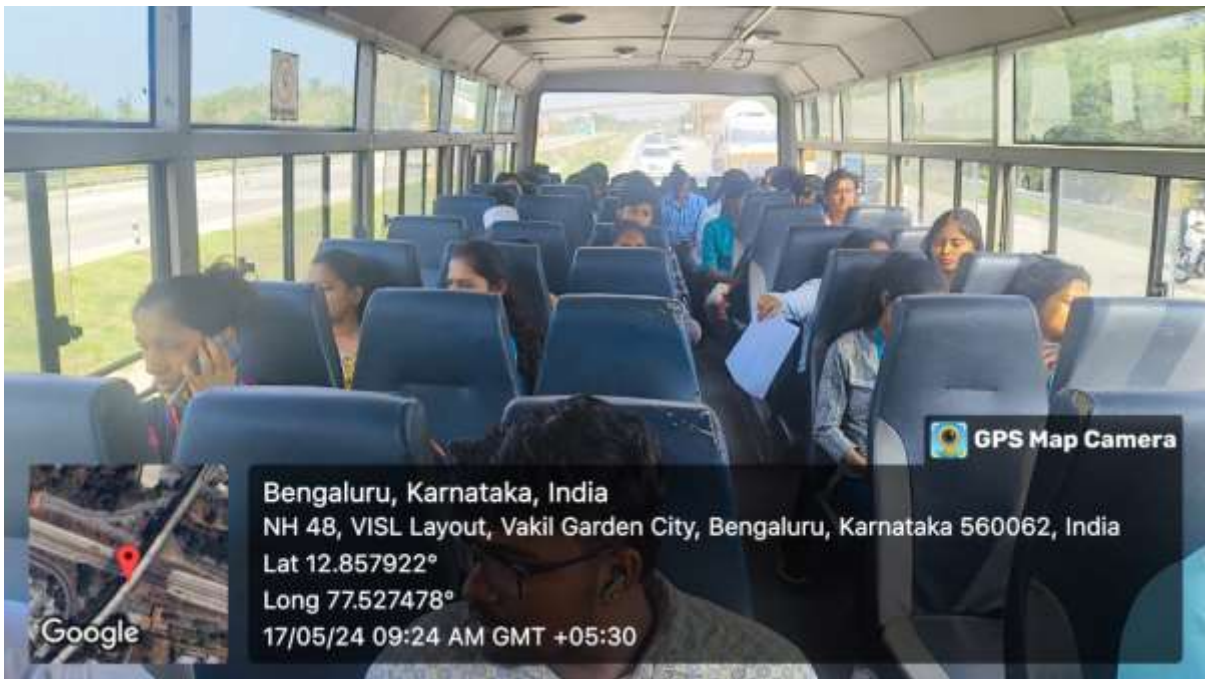
Figure 2 Students are boarded to industrial visit in the college bus

Campus: #14, Ramohalli Cross, Kumbalgotu, Mysore Road, Bengaluru – 560074