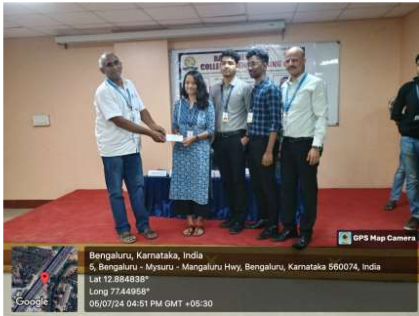
Fig 11 Quiz Competition 1st prize winners

Prize Distribution to all the winners and runners