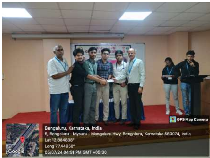
Fig 12. Quiz Competition 2 nd prize winners