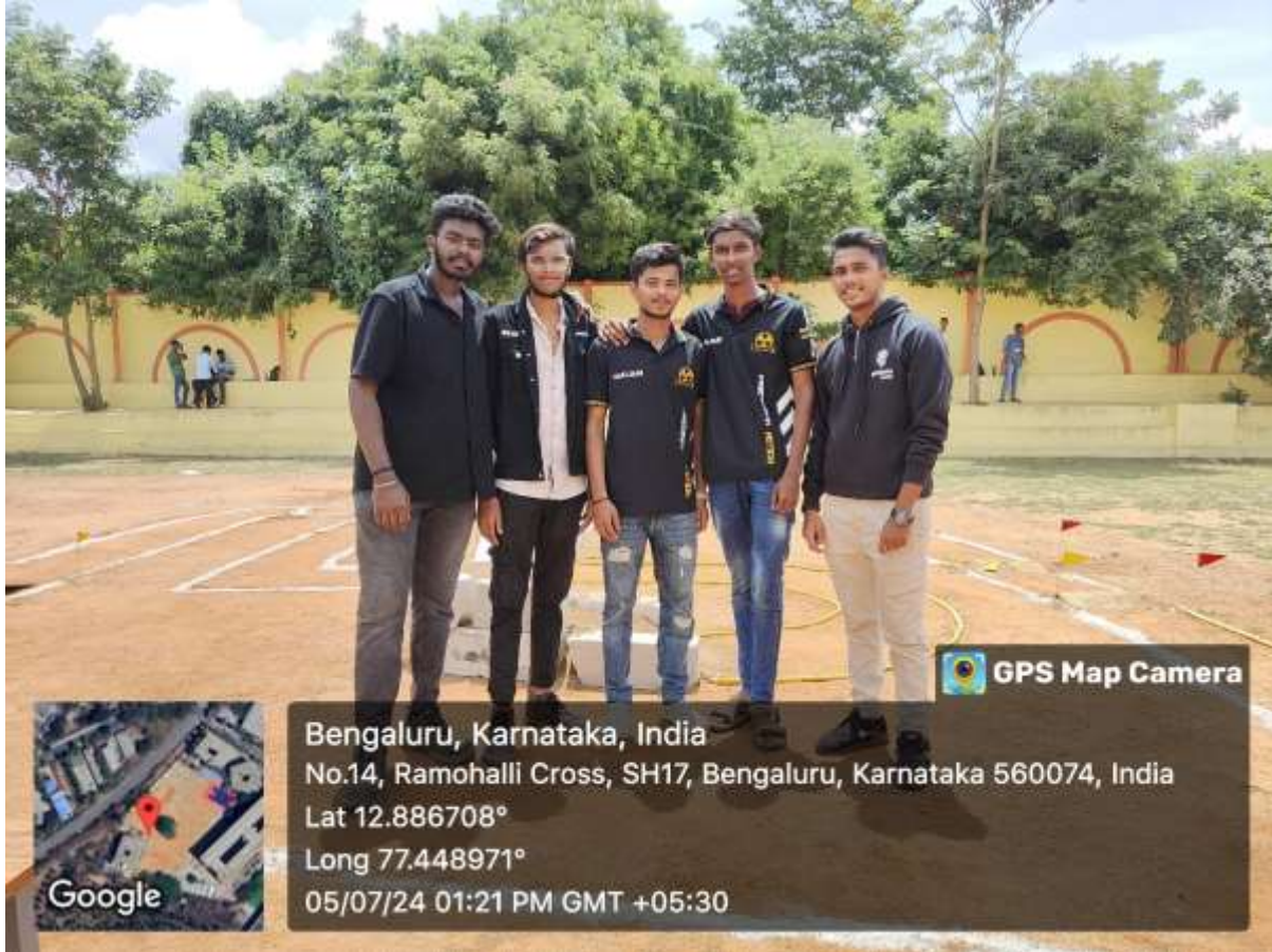
Fig 21 Roborace 1 st and 2 nd prize winners

We thank all the students, faculty members and the participants who came from various Colleges and Universities like Christ University, Ramaiah University, AJ college of Engineering and Technology, Sri Ramkrishna College of Engineering Coimbatore, Bangalore Institute of Technology, RV college of Engineering, Dayananda Sagar Academy, and our Rajarajeswari College of Engineering for taking part in our 1 st National Level Technical Symposium KRITAAAYU 2024 and making it a grand successful event.