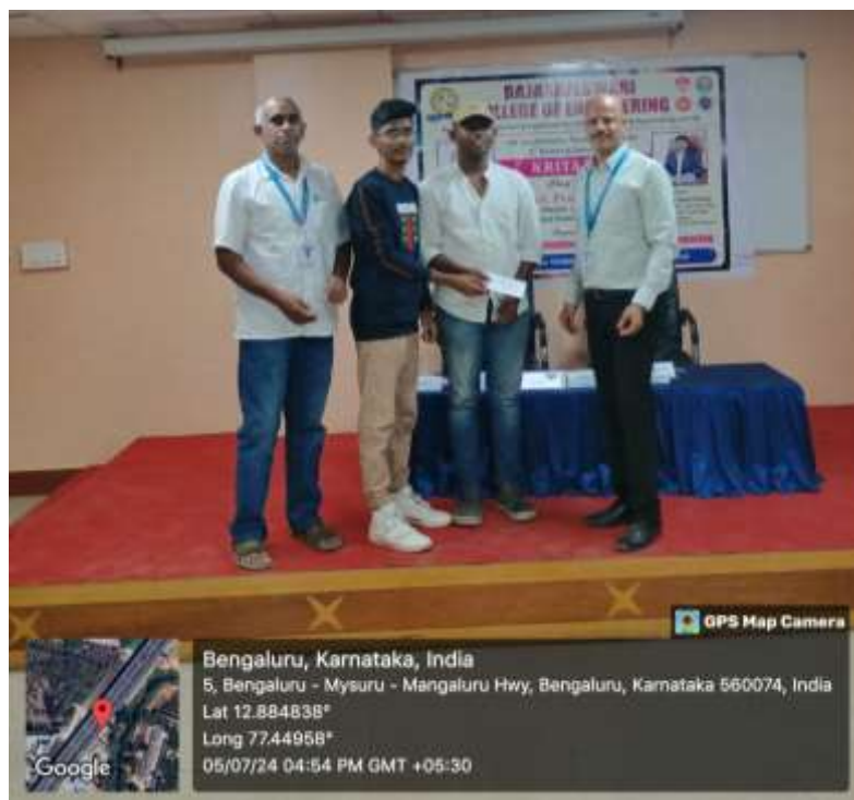
Fig 18. Line Follower Robot 2 nd prize winners