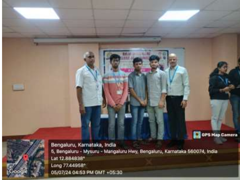
Fig 15. Project expo 1st prize winners