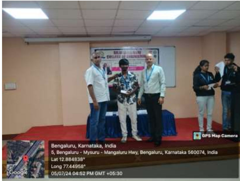
Fig 13. Rubrics cube 1st prize winner