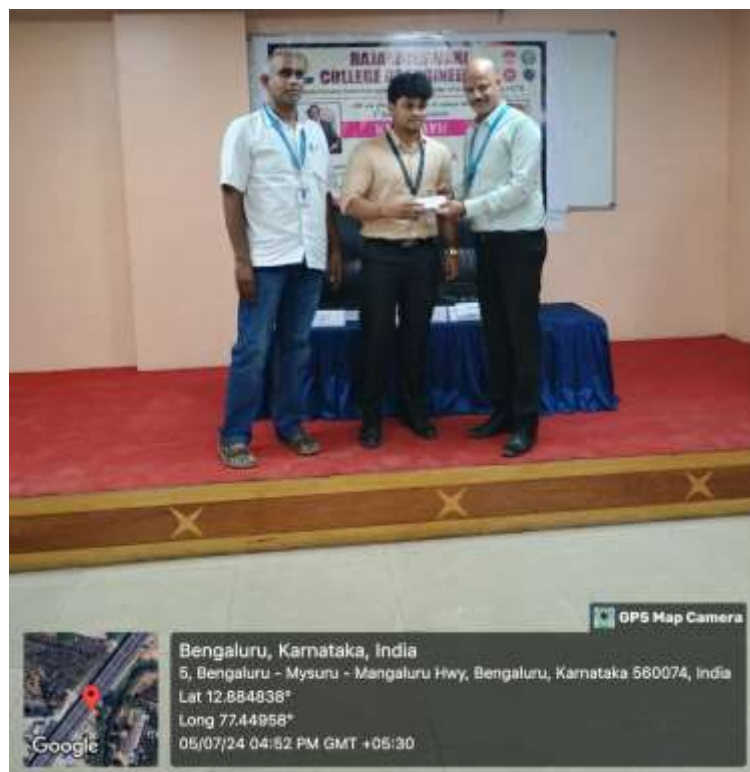
Fig 14. Rubrics cube 2 nd prize winner