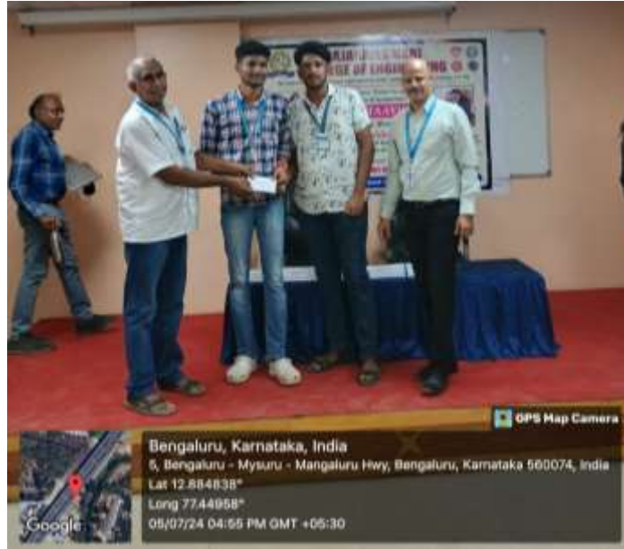
Fig 19. BGMI 1st prize winners