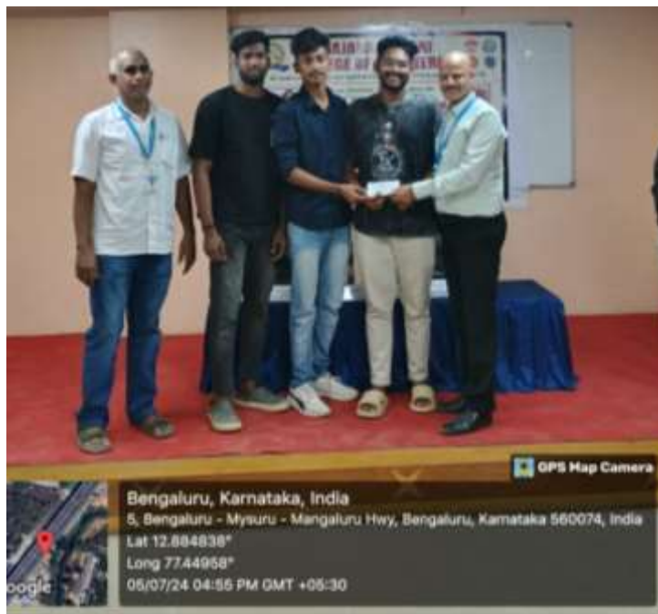
Fig 20 BGMI 2 nd prize winners

Campus: #14, Ramohalli Cross, Kumbalgotu, Mysore Road, Bengaluru – 560074