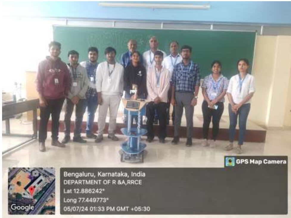
Fig 10 Students and participants with their projects

Campus: #14, Ramohalli Cross, Kumbalgotu, Mysore Road, Bengaluru – 560074