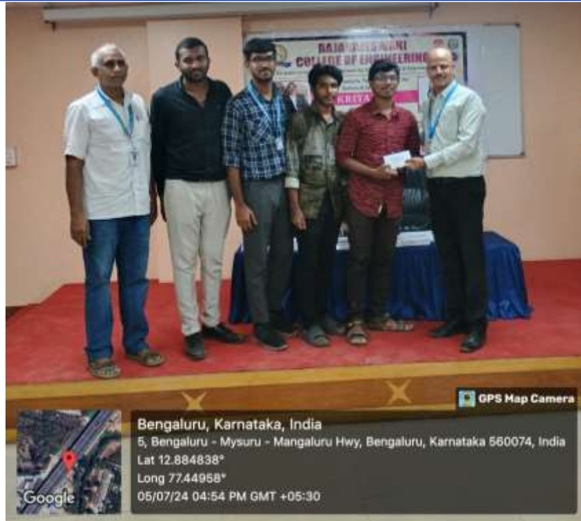
Fig 17. Line Follower Robot 1st prize winners