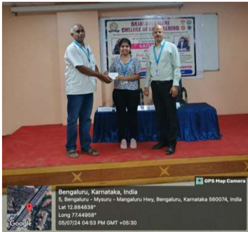
Fig 16. Project expo 2 nd prize winner

Campus: #14, Ramohalli Cross, Kumbalgotu, Mysore Road, Bengaluru – 560074