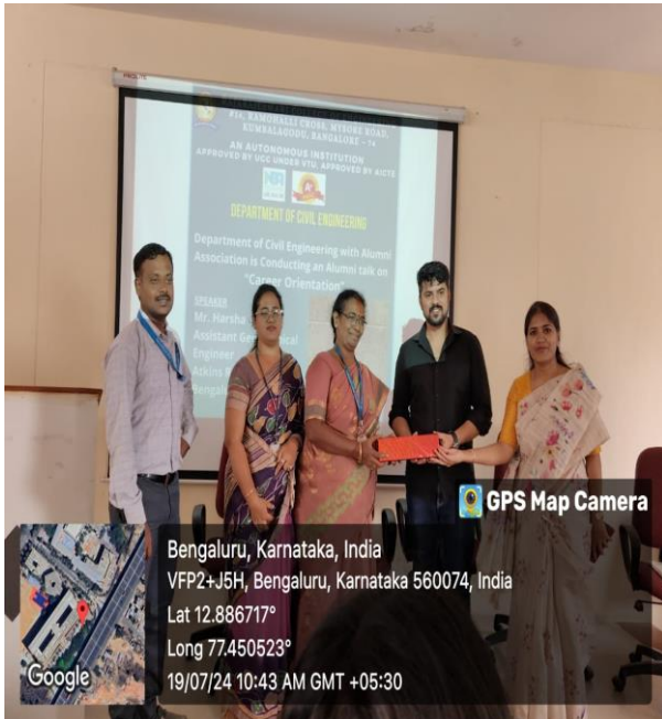
Alumni Interaction with student

Bengaluru, Karnataka, India VFP2+J5H, Bengaluru, Karnataka 560074, India Lat 12.886717° Long 77.450523° 19/07/24 10:43 AM GMT +05:30