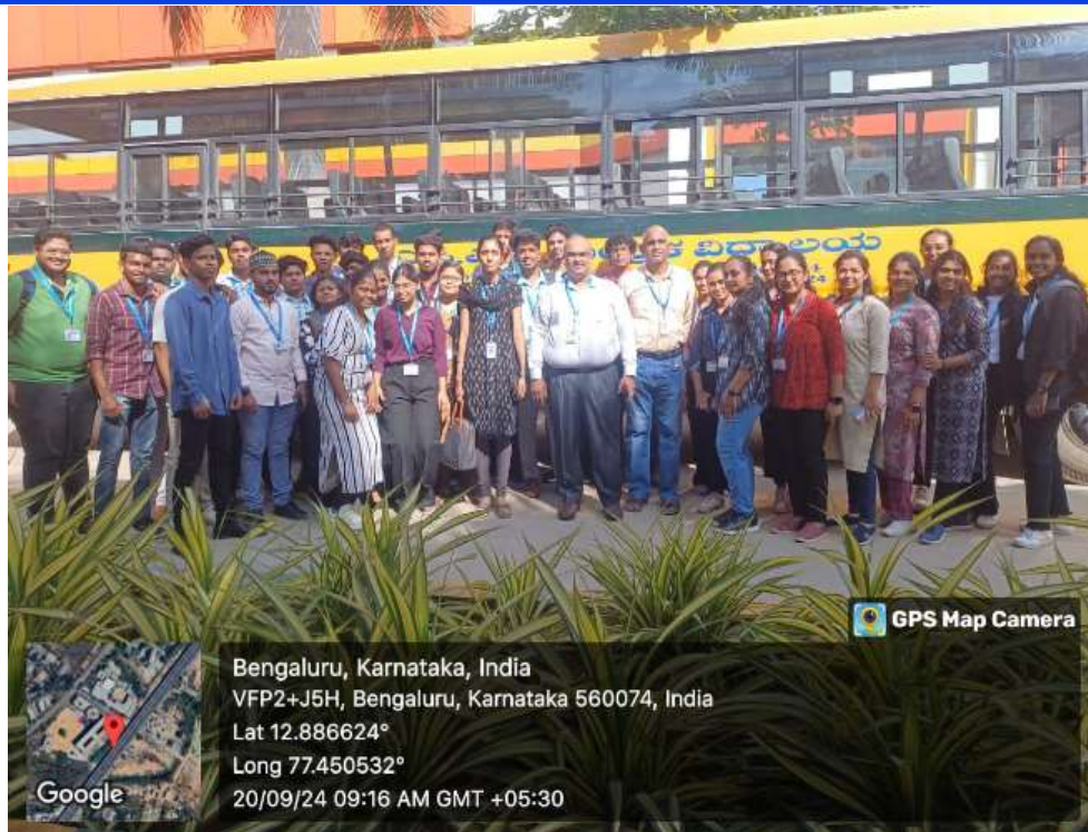
Students of 2 nd year Department of Robotics and Automation are visit to Fanuc India Pvt. Ltd., Electronic City, Bangalore.