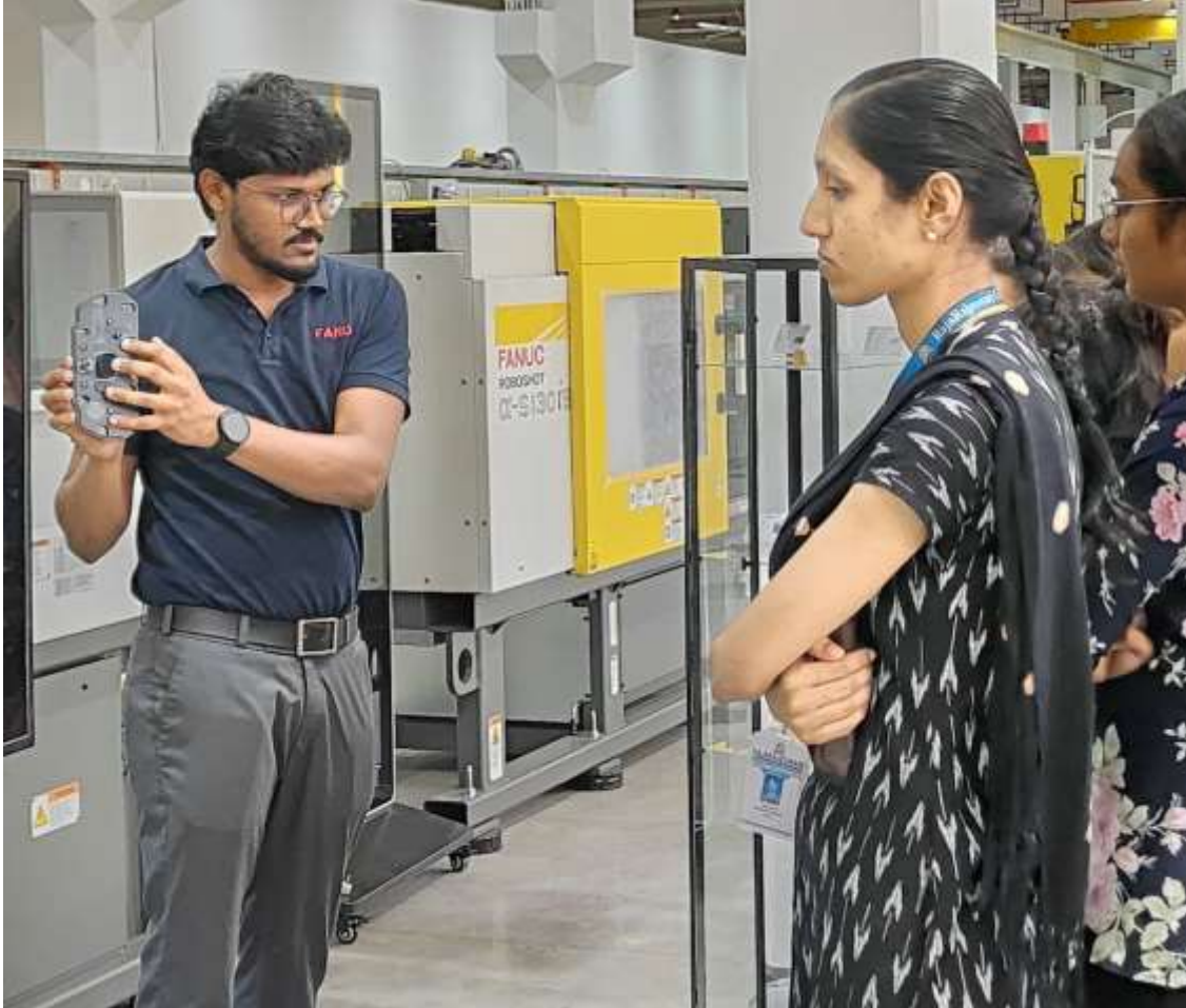
Faculty and Students observing the FANUC Robot

https://www.linkedin.com/posts/jaiker-neil-fernandez-b6811175_industrialvisit-fosteringrelationships-futureworkforce-ugcPost-7243123710713323520-vyQA?utm_source=share&utm_medium=member_android