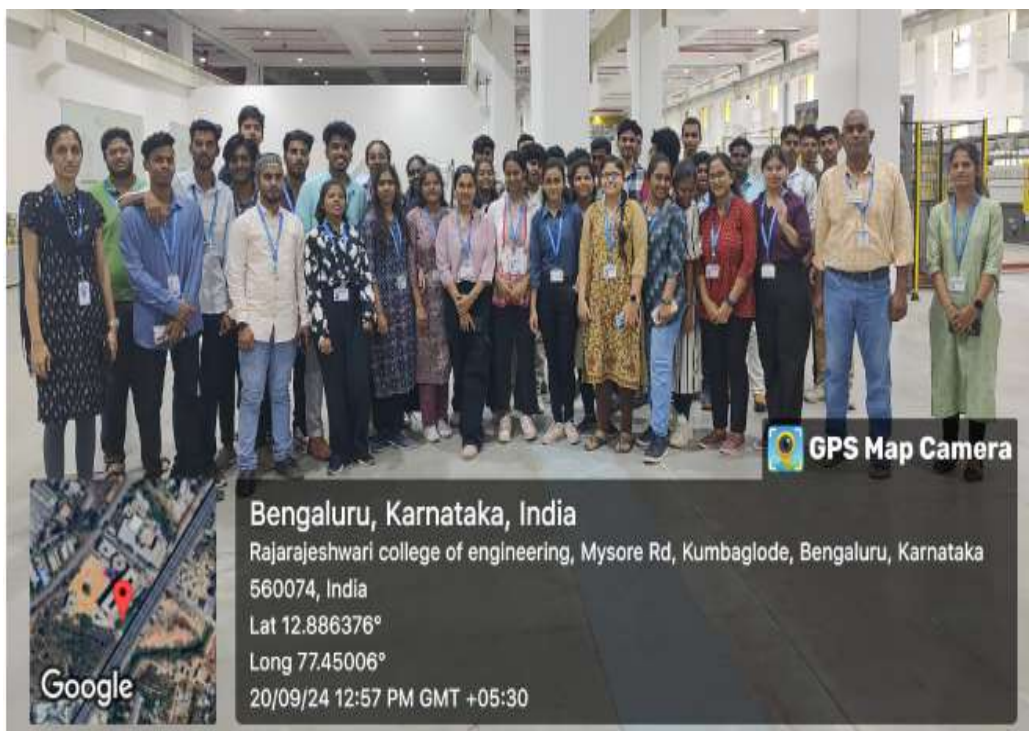
Group photo during the Industrial visit of 2 nd year students of the Department of Robotics and Automation to Fanuc India Pvt. Ltd.”Electronic City, Bangalore

Campus: #14, Ramohalli Cross, Kumbalgotu, Mysore Road, Bengaluru – 560074