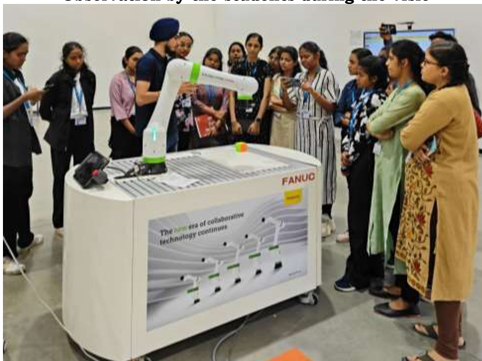
Students observing the working of FANUC Cobot

Campus: #14, Ramohalli Cross, Kumbagodu, Mysore Road, Bengaluru – 560074