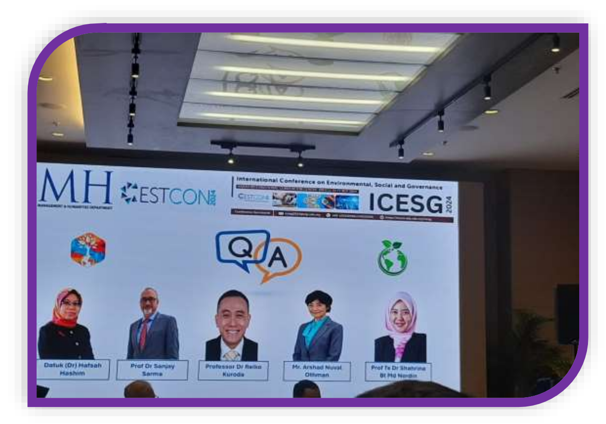
Research Forum Discussion on 11th Sept 2024 Wednesday

Campus: #14, Ramohalli Cross, Kumbalgodu, Mysore Road, Bengaluru – 560074