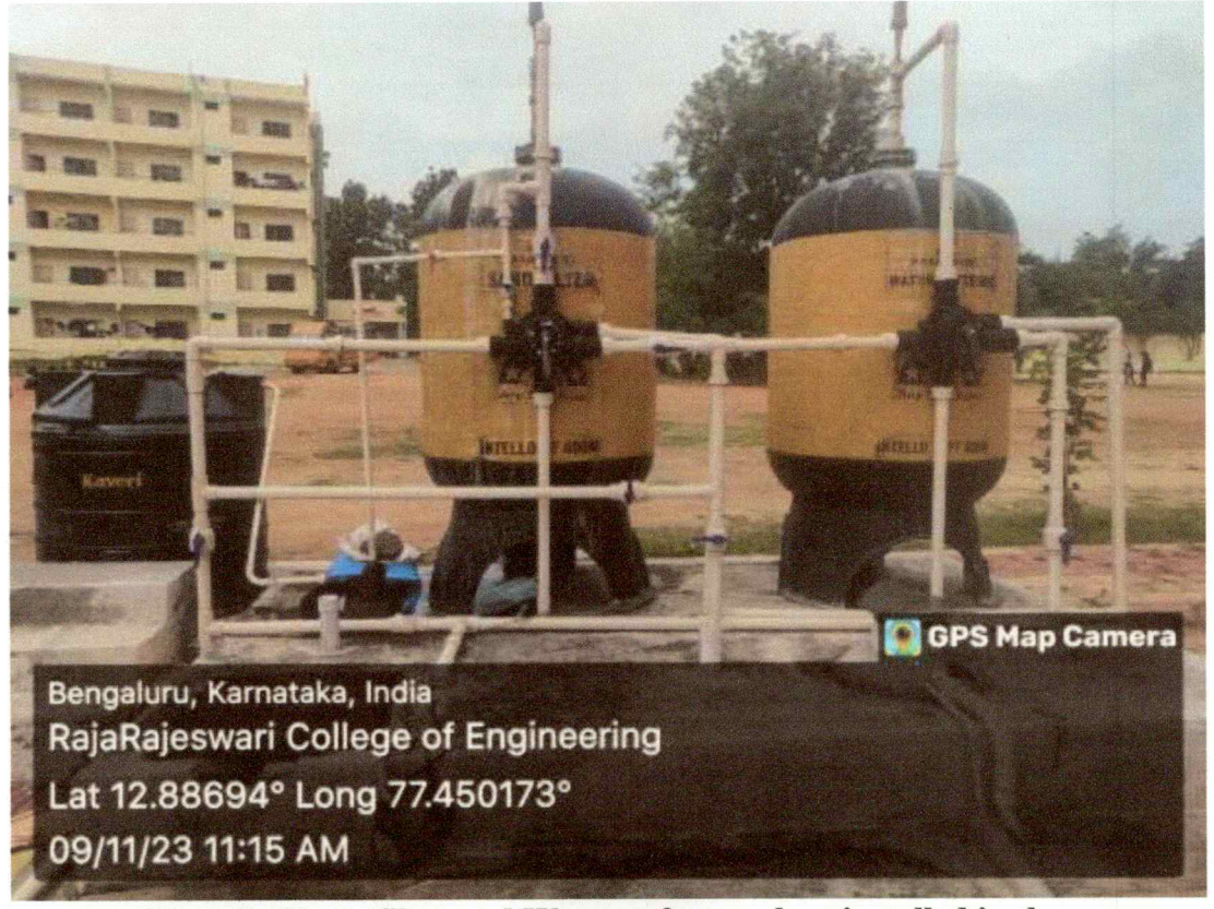
Photo.5: Water filter and Water softener plant installed in the campus Table.1. Specifications of Water filter and Water softener plant installed in the campus

ion exchange, turning it from hard water to softened water. It delivers softened water by removing hardness minerals from mains water supply.