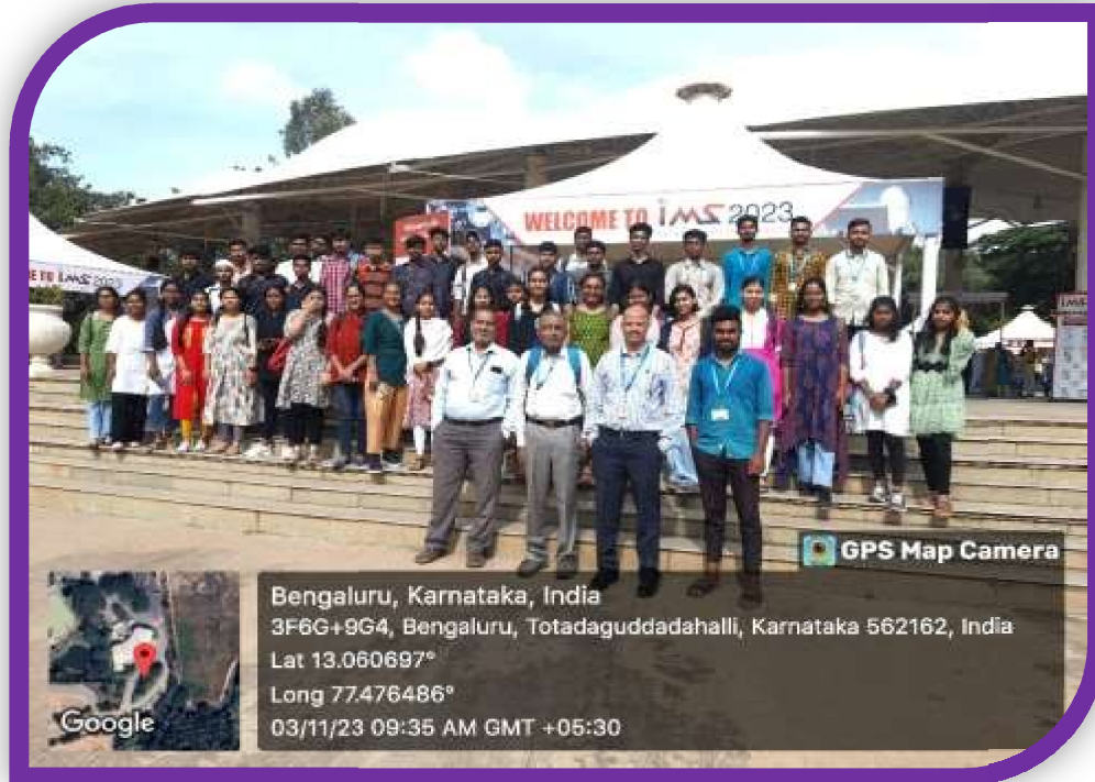
Group photo in the India Manufacturing Show cum Innovation Expo 2023 at Bangalore International Exhibition Center (BIEC)

Dept. of Robotics and Automation & RajaRajeswari Institution Innovation Council (RRIIC)