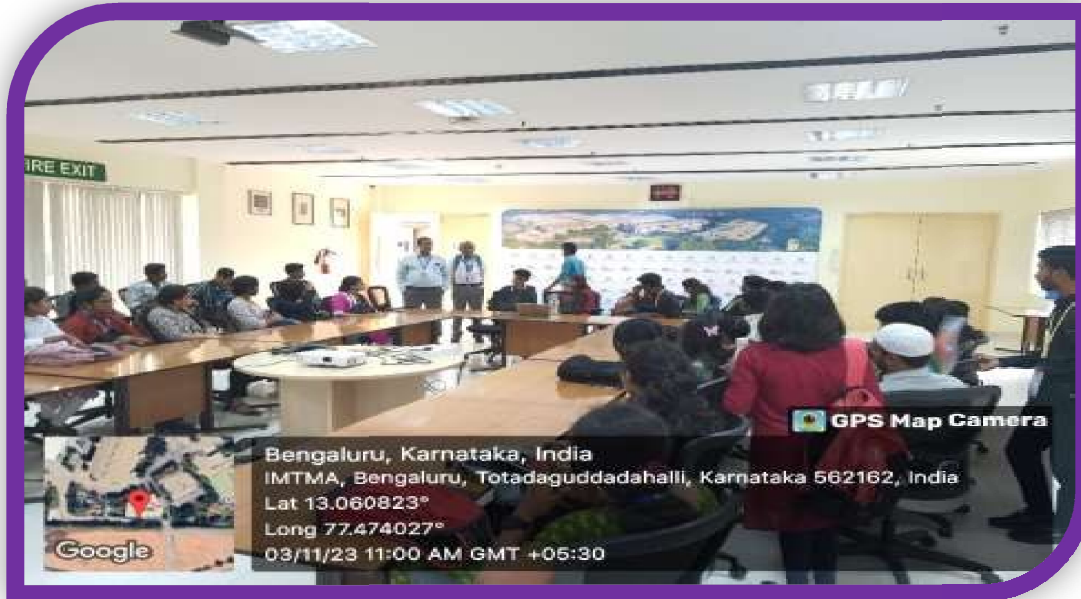
Students are waiting in the Seminar Hall IMTMA

Dept. of Robotics and Automation & RajaRajeswari Institution Innovation Council (RRIIC)