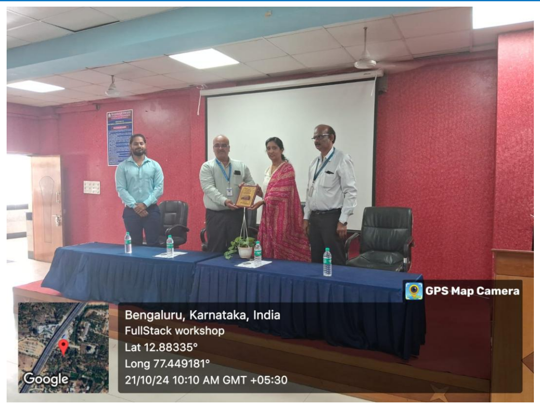
Presenting memento for the speaker