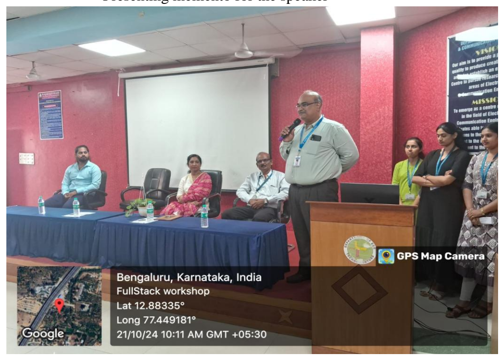
Principle addressing the students.

Campus: #14, Ramohalli Cross, Kumbalgodu, Mysore Road, Bengaluru – 560074