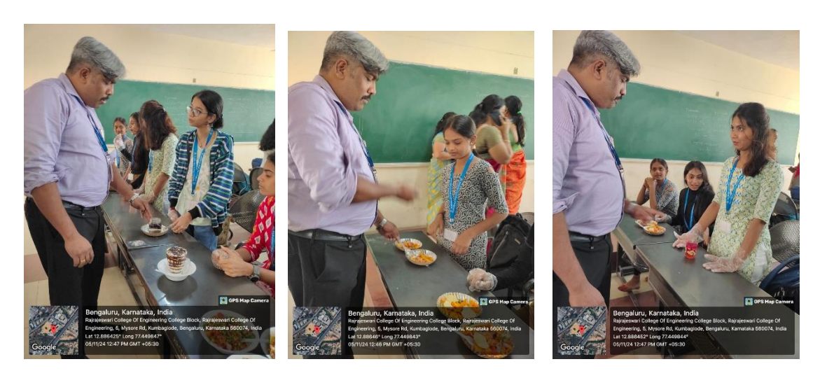
Students presenting their Foods in Beat the Heat-2K24

Department of Electrical & Electronics Engineering