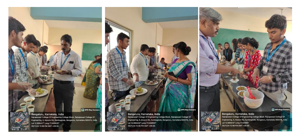
Students presenting their Foods in Beat the Heat-2K24