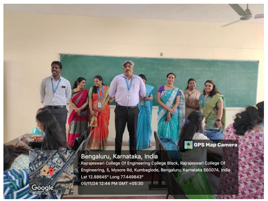
Faculties givinig their guidelines in Beat the Heat-2K24