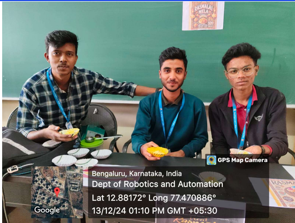
3 rd sem R&A Students display their food at the heritage food walk 2024