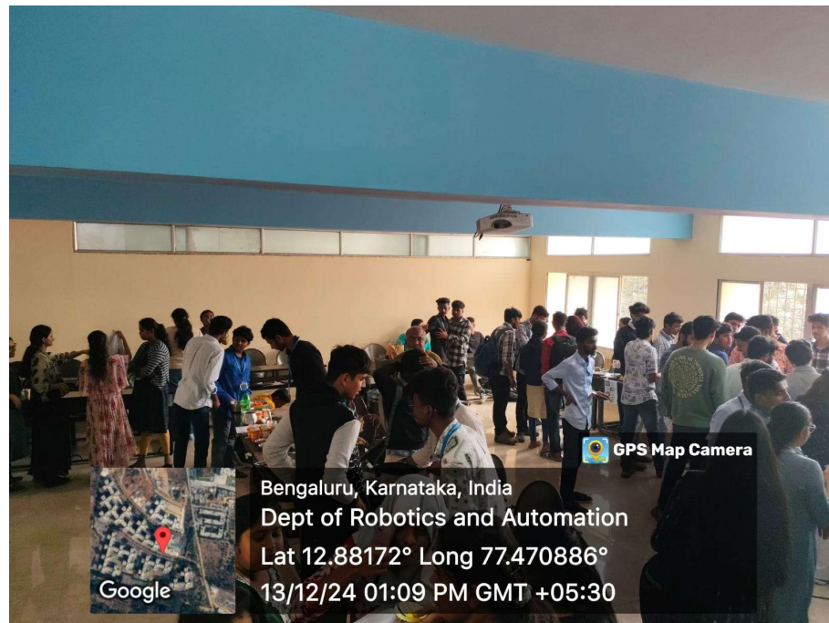
Students are tasting food at the heritage food walk 2024