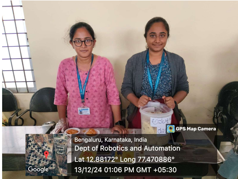
3 rd sem R&A Students display their food at the heritage food walk 2024