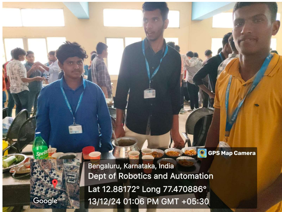
3 rd sem R&A Students display their food at the heritage food walk 2024