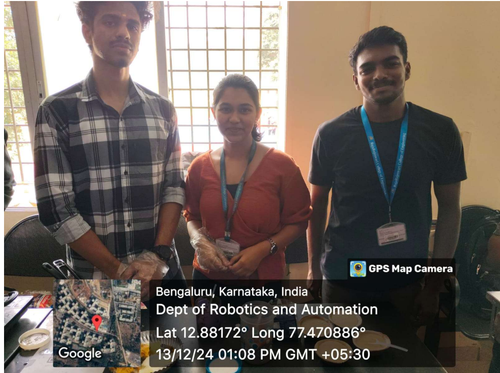
3 rd sem R&A Students display their food at the heritage food walk 2024