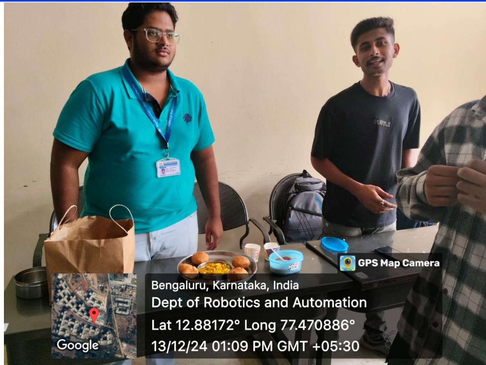
3 rd sem R&A Students display their food at the heritage food walk 2024