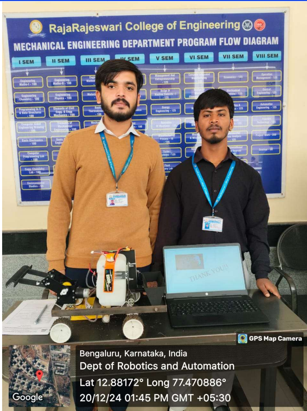
7 th sem Mechanical Engineering students displayed their project