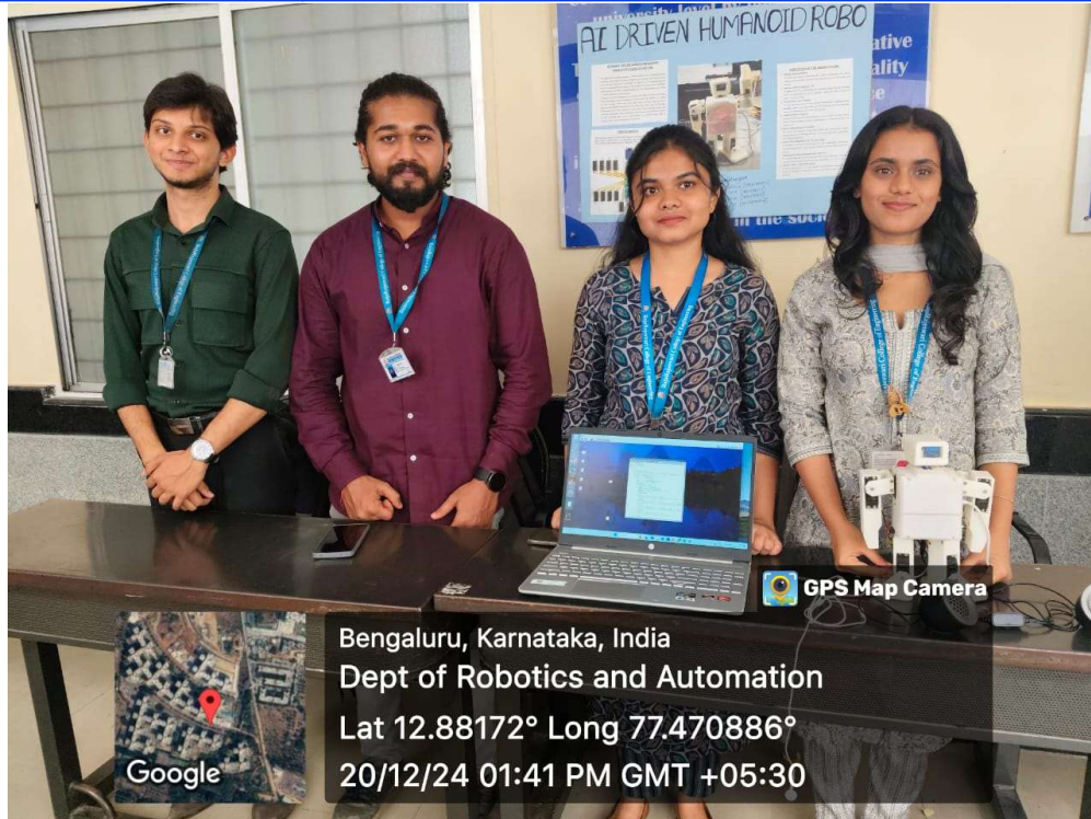
7 th sem R&A students displayed their project