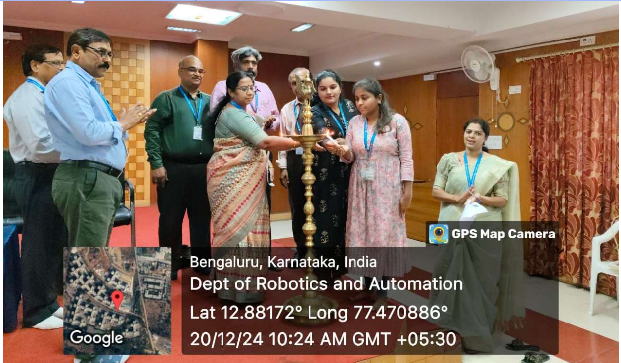
Lighting the lamp by Chief Guest, faculty members and students during Project Exhibition “TechXhibition- 2024”