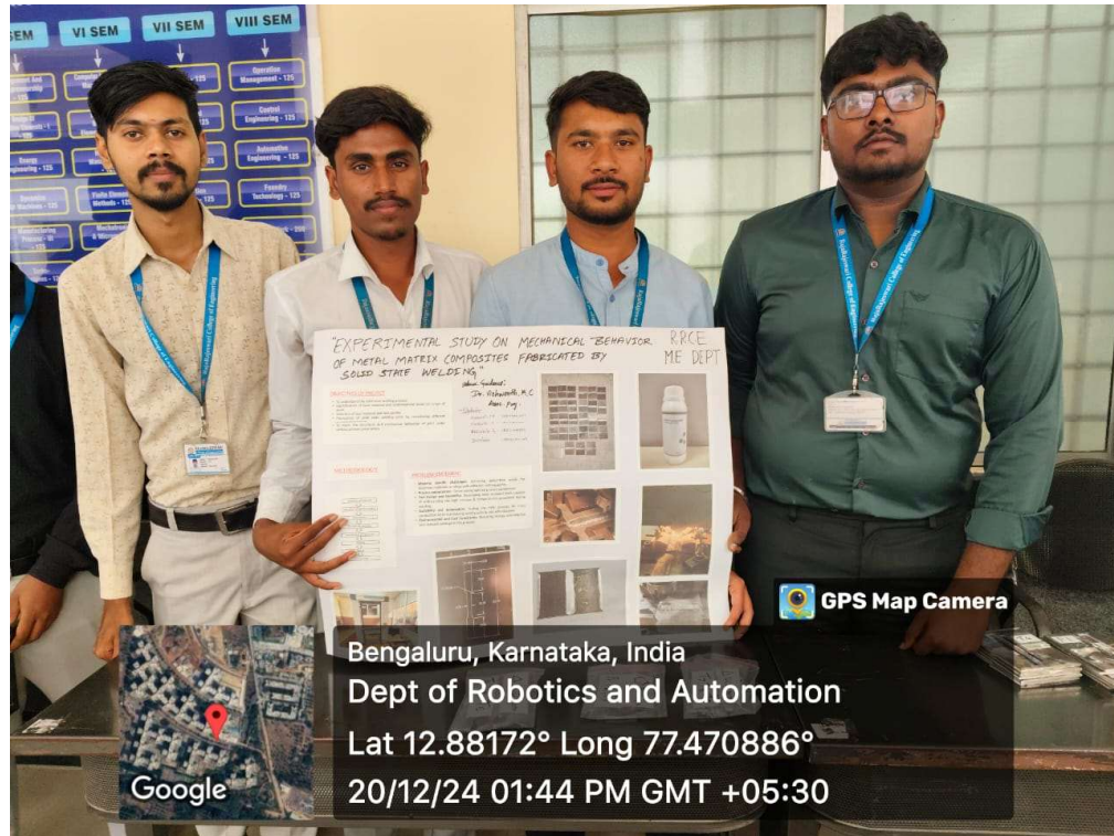
7 th sem Mechanical Engineering students displayed their project