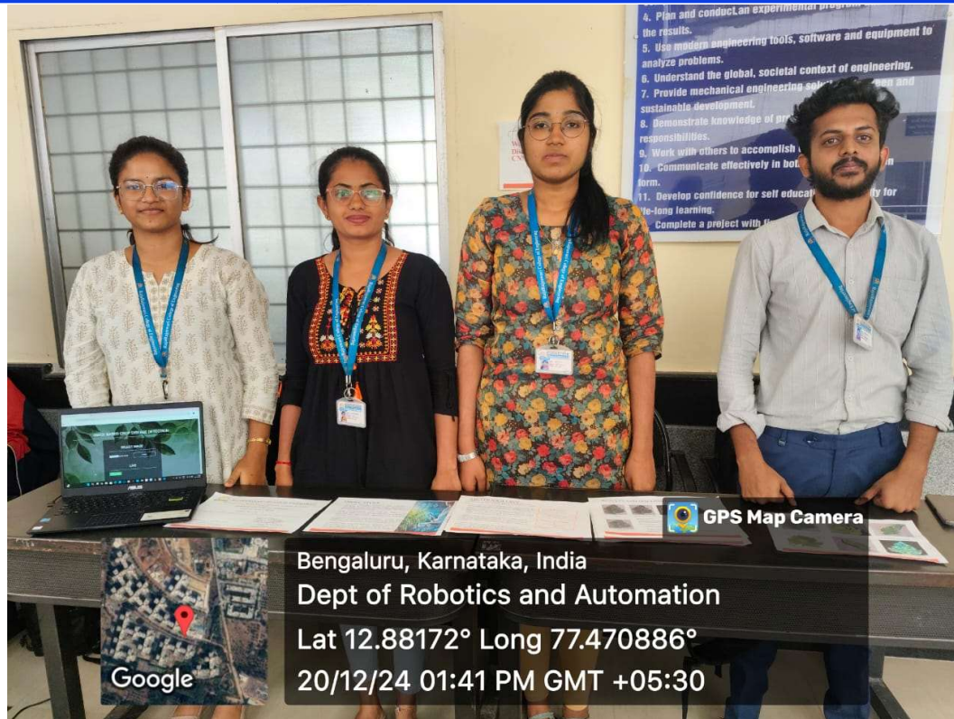
7 th sem R&A students displayed their project