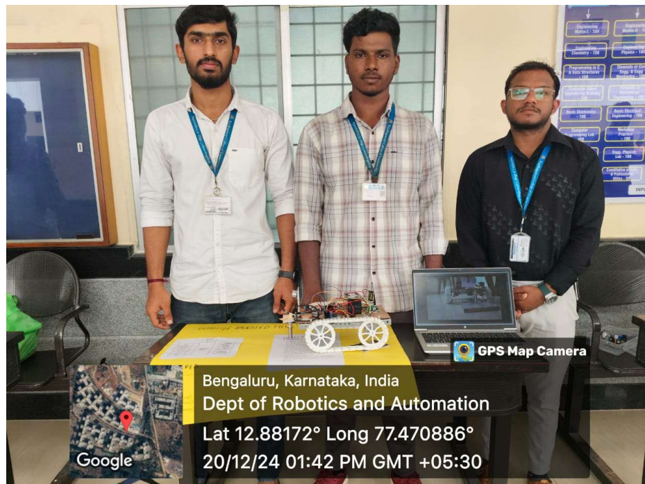
7 th sem R&A students displayed their project