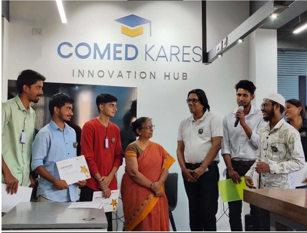
Students are with the guests during the awarding ceremony of AgriTech Makeathon: Innovation showcase- 2025