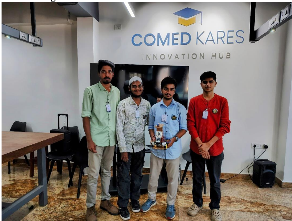
Students are with their model during the AgriTech Makeathon: Innovation showcase- 2025

Campus: #14, Ramohalli Cross, Kumbalgodu, Mysore Road, Bengaluru – 560074